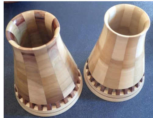
Ron Rupert – Poplar-Walnut Segmented Cooling Towers