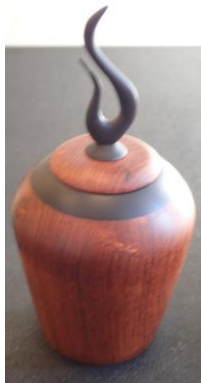
Victor Alvarado – Unknown Wood - Blackwood finial Lidded Box