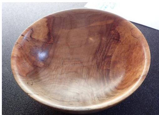
Bill Killough – Spalted Hackberry Bowl

The photographer will only be available until 9:25 A.M. on the day of the meeting to take photos of the instant gallery items.