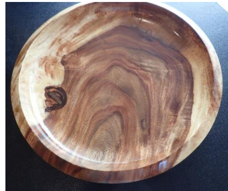
Ron Bahm – East Indian Rosewood Platter