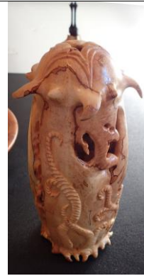
Ralph Watts – Spalted Cottonwood Thang