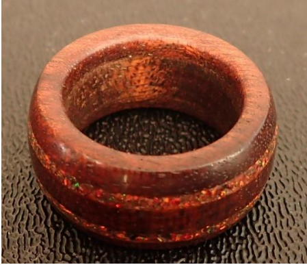
Ian Ahlen - African Redwood-Bloodwood Ring