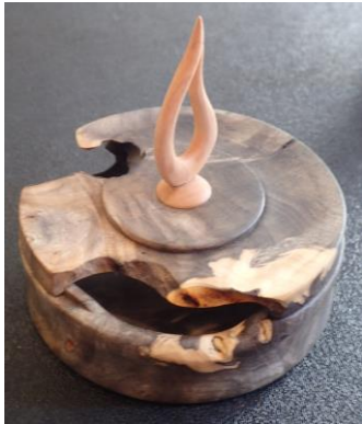
Victor Alvarado - Buckeye burl - Maple finial Lidded Box

Scott Eckstein - Bristlecone Pine-Mesquite Segmented Platter w/ pyrography