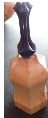
Eddie Bell – Tamarind-African Blackwood Lidded Box