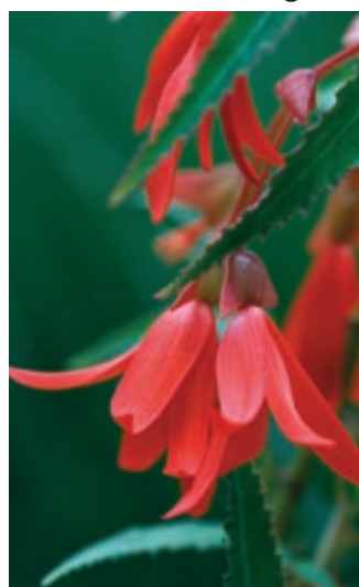
Begonia boliviensis Bonfire® Scarlet Bonfire® Scarlet begonia

Bonfire® is not only Selecta's best selling single variety, it is also one of the best consumer plants out there. New this year is Bonfire® Scarlet. It has a very similar habit and flower compared to the original, but in an attractive red. Like the original it is drought tolerant, takes the heat and sun, and will perform well all summer long. Bonfire® performs best when planted in full sun, where it grows large quickly to create a sensational look. It flowers from early summer through early frost, handling more heat and cold than many other begonia varieties. Bonfire® recovers easily after water stress. Selecta