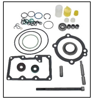
M-3190677RK Fuel Pump Repair Kit