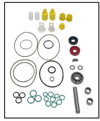
M-3178021RK Fuel Pump Repair Kit