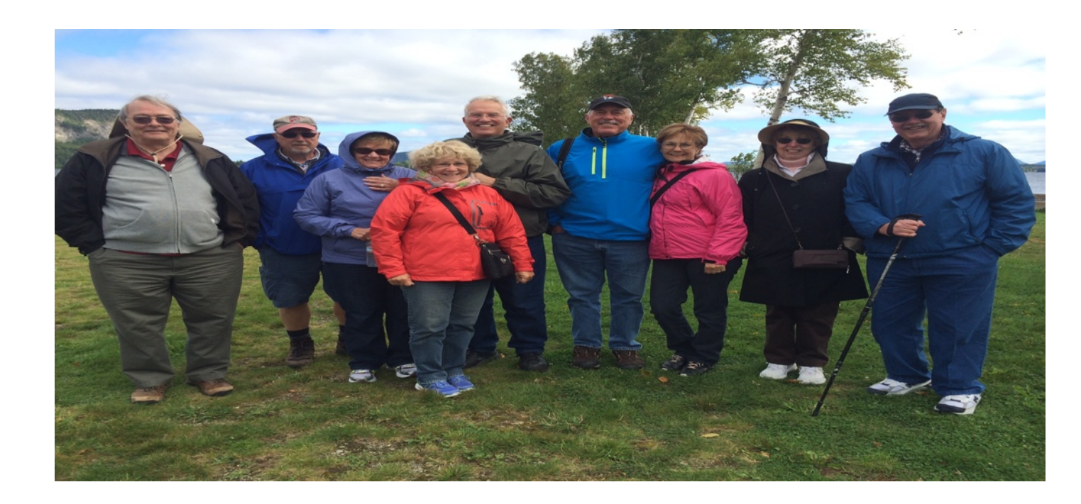
Newcomers & Neighbors Club Web Site - www.kptanewcomers.org