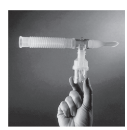
Figure 5: Nebulizer mouthpiece