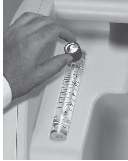
Elite (top) and Intensity (bottom)

To view the flowmeter at the proper angle, note that the back line and the front numbered line must give the appearance of just one line.