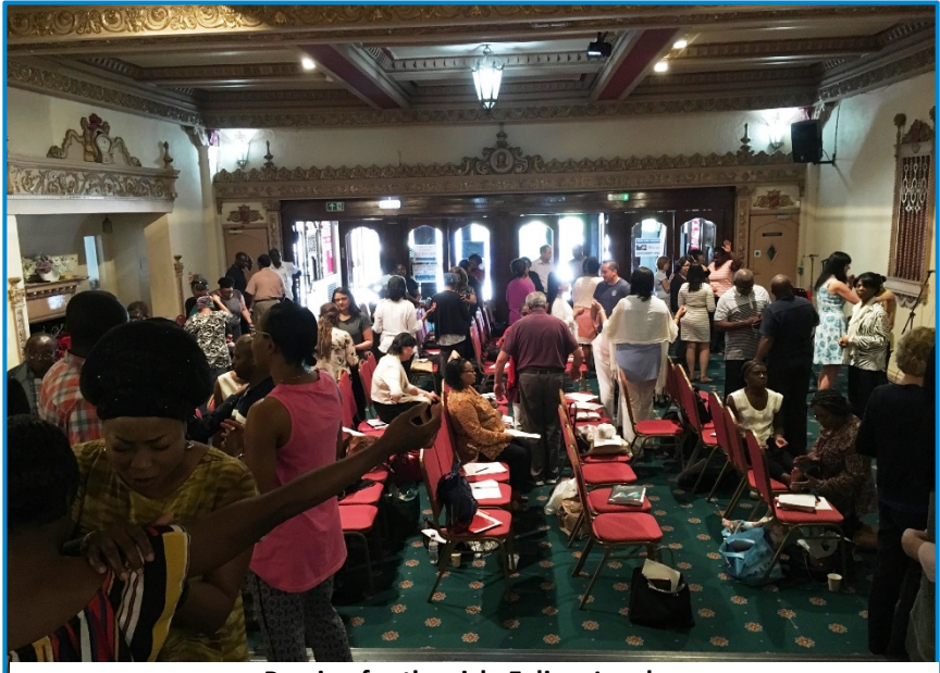
Praying for the sick, Ealing, London

been healed of multiple sclerosis - after prayer by the church leaders two years ago, a subsequent scan showed that the lesions in her brain and spinal cord had disappeared. She no longer needs her disability aids and is enjoying full health.