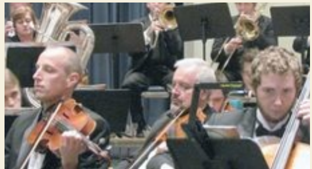
CRSO Symphony Orchestra musicians at the 12/6/2014 Christmas Concert.