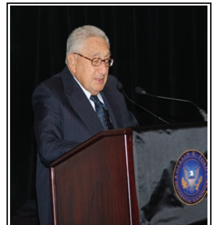
Dr. Henry Kissinger at the 2009 Annual Gerald R. Ford Presidential Foundation Dinner in Washington, DC.

"Secretary Kissinger, whom we're honoring tonight, we have been impressed by our association with him on a personal basis; impressed by his intellect and his insight; and thankful for his mighty efforts for the cause of peace for mankind on a worldwide basis. He is, so far as this American is concerned, the greatest Secretary of State in the history of our republic."