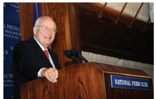
Trustee Dick Cheney at the National Press Club during awards presentation