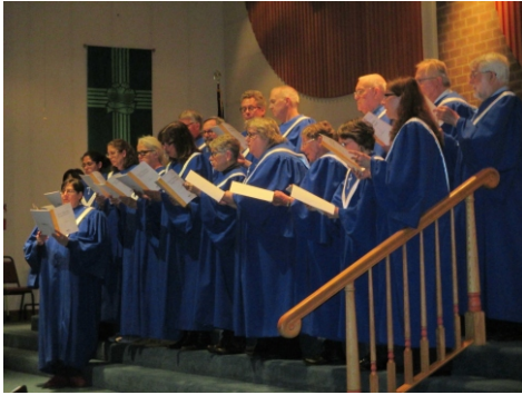
19 members of the GS Choir performed at the Webster Council of Churches' annual "Festival of Choirs" on Nov. 5 th , held this year at the Church of the Holy Spirit on Hatch Road in Webster.