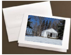
Winter Scene (B)