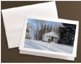
Winter Scene (A)