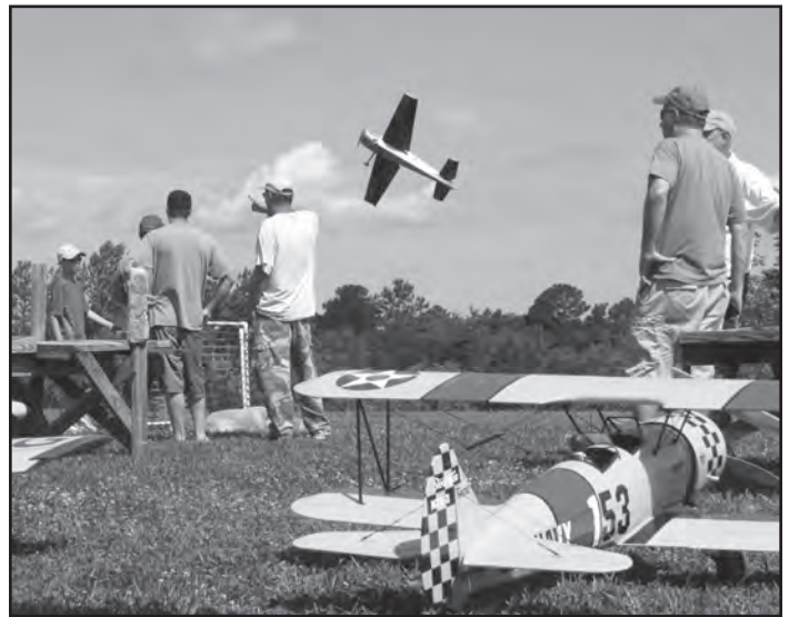
The Catawba Valley R/Cers held their second annual Fun Fly and donated the proceeds to Sipe's.