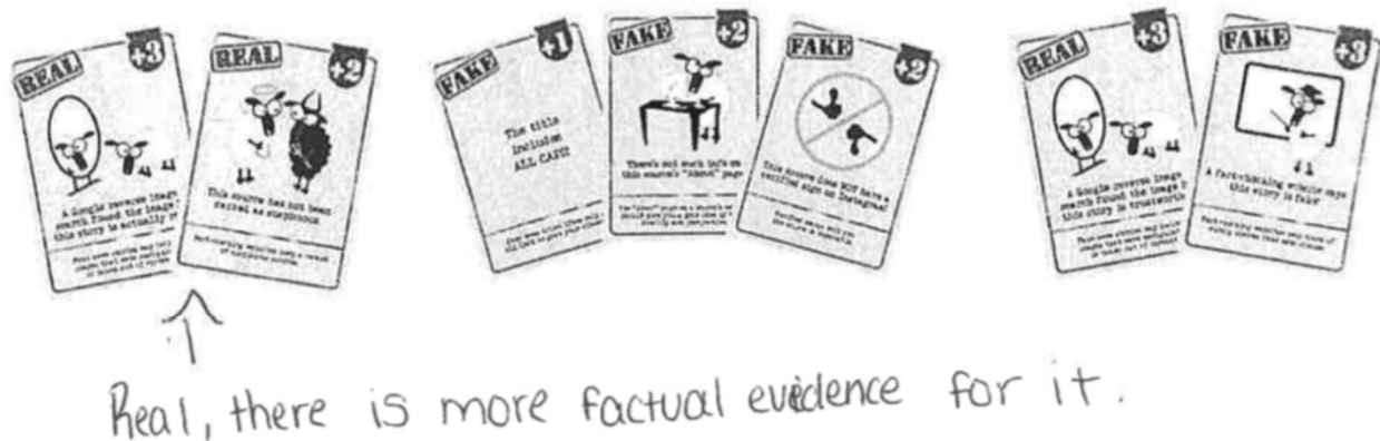
Figure 2. A student response to a post-game reflection question asking which of the three hands of evidence is the strongest. While the middle hand should be considered the strongest, as it provides three different types of evidence instead of two, this student thought the first hand is strongest just because it contained evidence in support of a “real” story.

Interviews with teachers after they implemented the game in their classroom confirmed the key findings derived from the student data (significantly, from teachers’ perspective as insiders to these classrooms, rather than the research team’s perspective as outsiders), while also shaping additional findings related to facilitation and classroom implementation, that could not have been captured in the playtesting sessions.