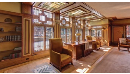
Meyer May House, Grand Rapids (Frank Lloyd Wright, 1908).

Kingswood Dining Hall, Cranbrook Educational Community, Bloomfield Hills (Eliel Saarinen, 1931). Photo: James Haefner/Michiaan State Historic Preservation Office