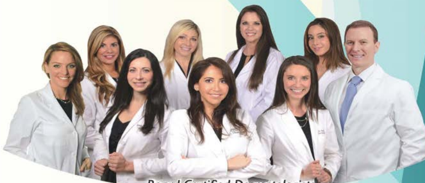
Board Certified Dermatologists

From Freckles to Frown Lines... Choose a Dermatologist for the Life of Your Skin