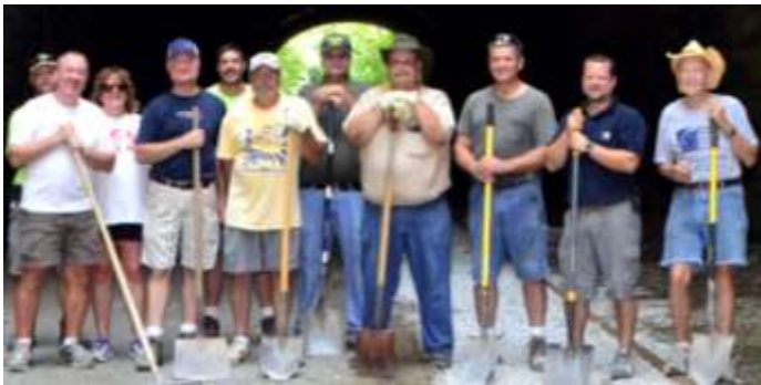
York Branch Public Service Project: Howard Tunnel Restoration