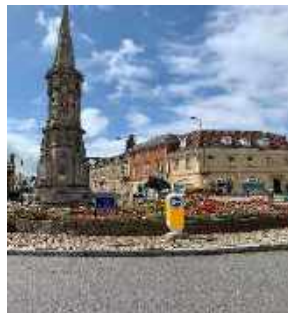
Ireen Sarbatta Woodington travelled to England and visited her hometown of Banbury Cross. Beautiful blooms!!