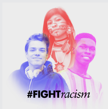
International Day for the Elimination of Racial Discrimination - March 21