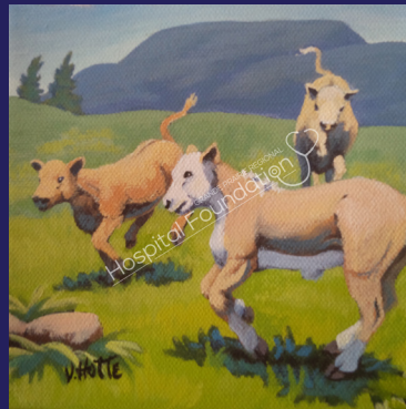
Artwork by Vicki Hotte

A portion of the proceeds from all sales will be donated to your hospital!