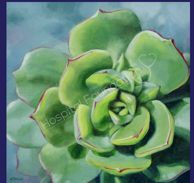
Artwork by Caily Oldershaw