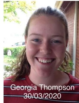
Georgia – Personal Care Attendant