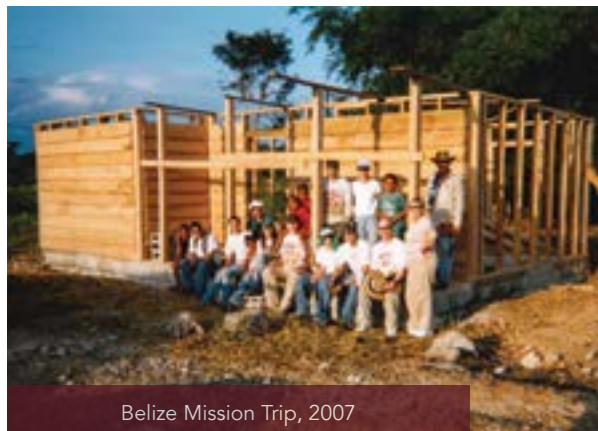
Belize Mission Trip, 2007