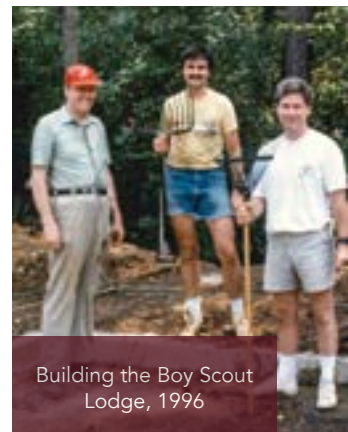
Building the Boy Scout Lodge, 1996