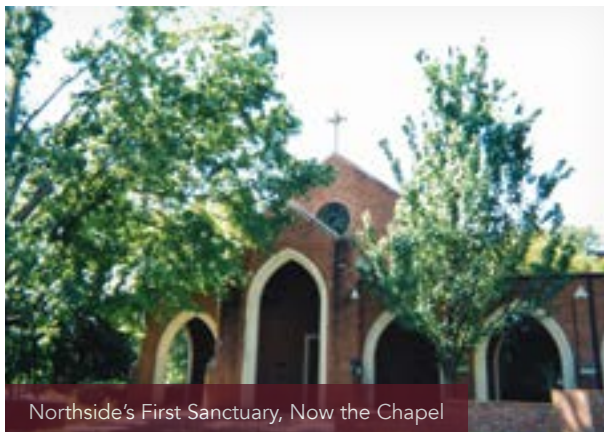
Northside's First Sanctuary, Now the Chapel