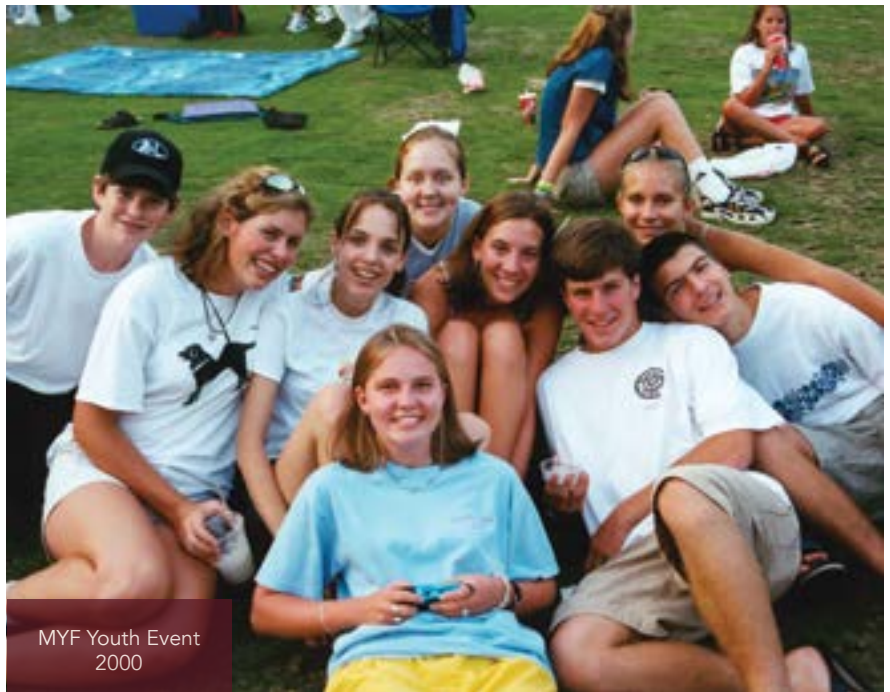
MYF Youth Event 2000