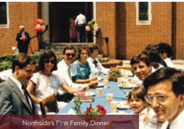
Northside's First Family Dinner