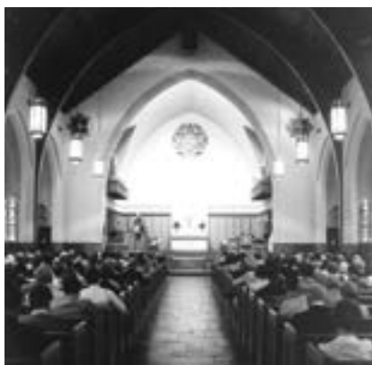
▲ On the cover: Northside Celebrates 65 Years See page 4.