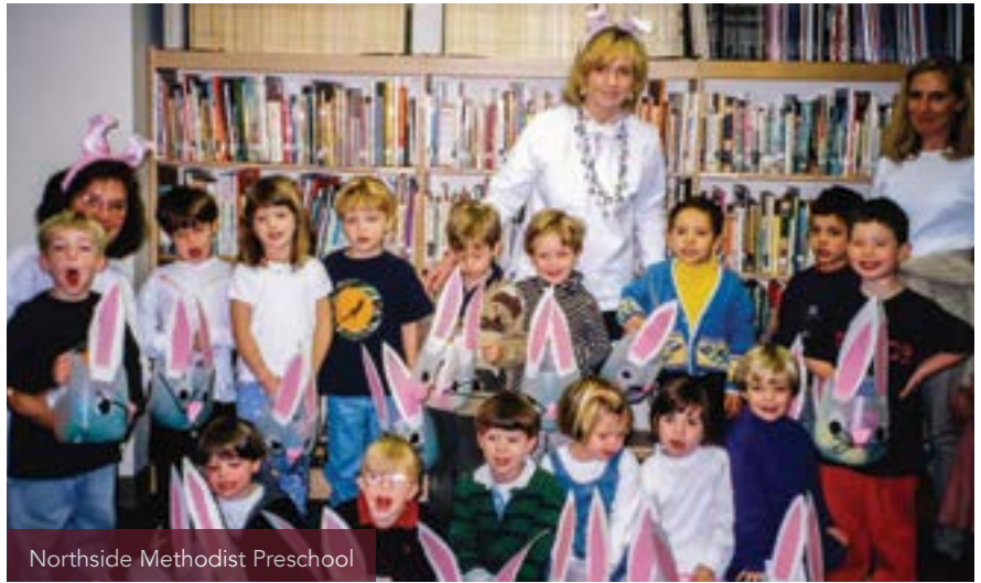
Northside Methodist Preschool