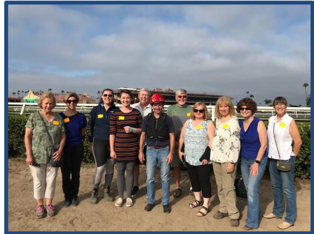
In the middle is Kent Desormeaux, a top jockey!