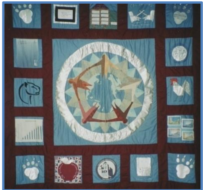
CSUSM 10 th Anniversary