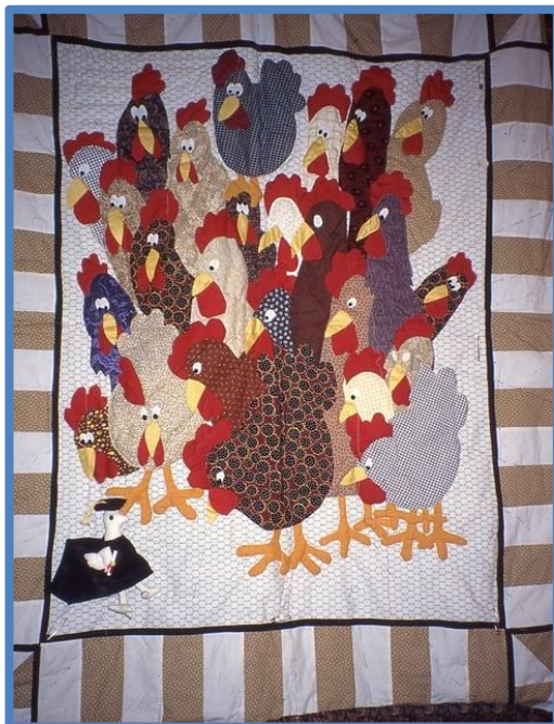
"The Early Bird Gets the Worm"