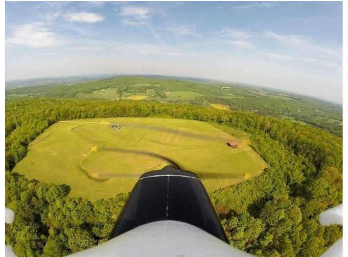
View from Bob Hoag's "Timber"