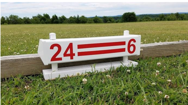
New Runway Markers Look Great!