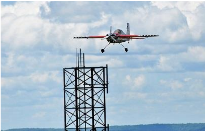
Neil Hunt's Extra 300 on Final