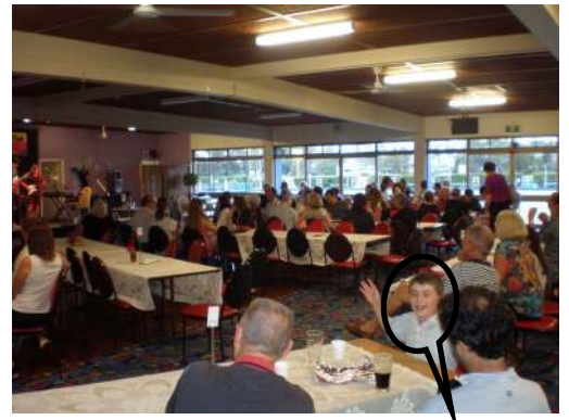
Can you spot this cheery lad?