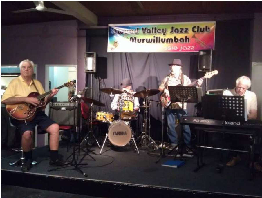
"THE EARLY BIRDS"