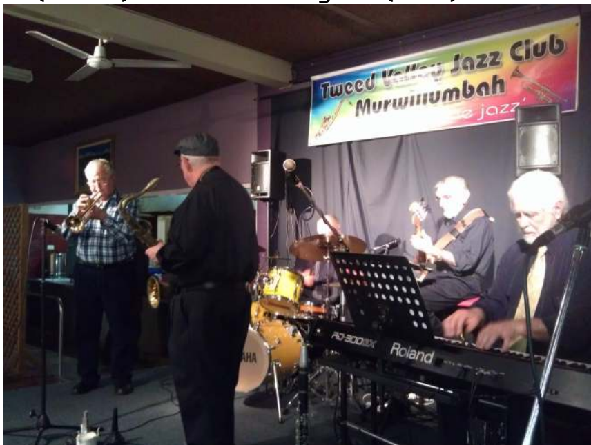
"RED WINE & CHEESIE GRIN JAZZ BAND"