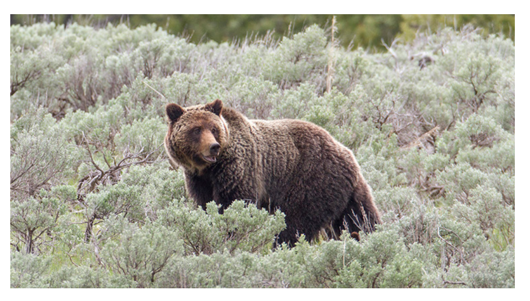
Researchers analyzed more than two decades of records to look for trends on grizzlies preying on livestock in the Greater Yellowstone Ecosystem.

"The number of depredations in any particular allotment were unrelated to the number of depredations in that allotment in previous years, suggesting bears are killing livestock opportunistically when they encounter them, rather than keying in on particular allotments," McNew said. Other findings were common sense. Grizzlies preyed on livestock more often when there were more bears around, they found, and they preferred sheep to cattle.