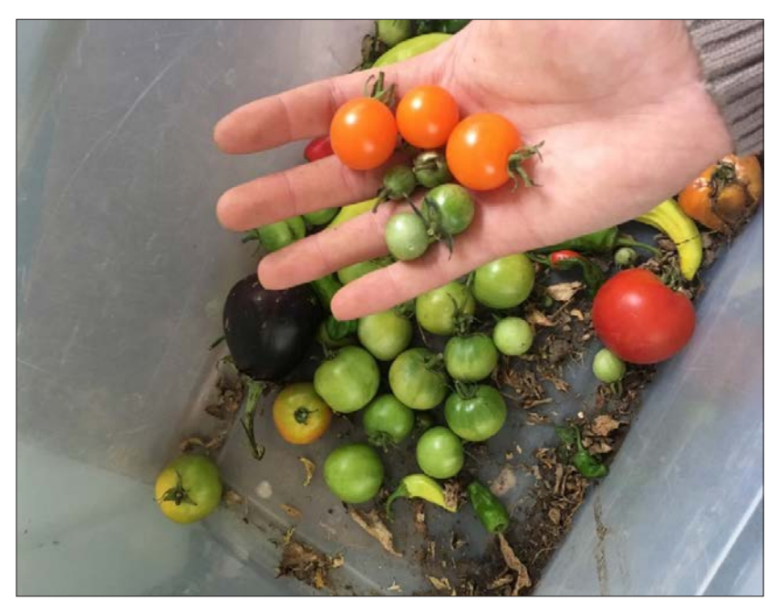
Vegetables collected from Black Cat Farms in Boulder, CO.

By advancing our understanding of the connection between soil health and livestock integrated cropping systems we can possibly create more sustainable farming systems in the U.S. A change such as this will increase profitability, efficiency and environmental health. With the addition of livestock, farmers can provide animals with low cost, high quality forages while adding nutritive inputs back into the soil, thus improving soil health and crop quality and yield. Integrating livestock into cropping systems allows for increases in soil health and productivity and is an efficient use of resources. Thus, it is important to understand the types of impacts integrating livestock has on soil health and crop yield in the Great-Northern Plains on small scale vegetable crops.