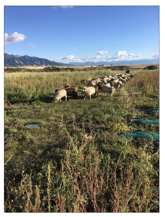
Sheep grazing squash residue at 13 Mile Lamb and Wool.

Soil sampling at Black Cat Farms in Boulder, CO.