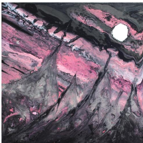
Mountains of the Moon Kaylene Gayner

Book your place soon as the classes are filling quickly