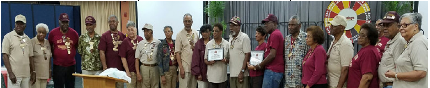
Our Lifetime Members receiving their lifetime badges. Tampa Florida, February 2017