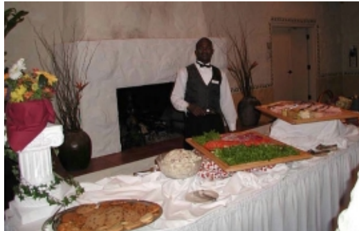
Since this was a San Diego Miata Club run, there HAD to be food involved. A spectacular layout was setup by the staff at La Casa Del Zorro.