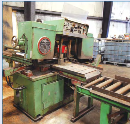
DOALL HC35A FULLY AUTOMATIC BANDSAW