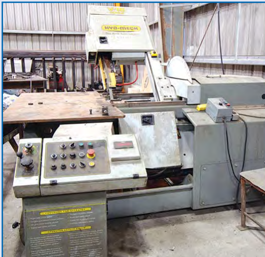
HYD-MECH VERTICAL BANDSAW