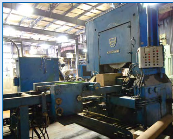
OHLER KA800HM COLD CIRCULAR SAW