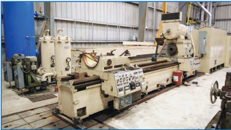
VDF WOHLBERG B-800-P DEEP HOLE BORING LATHE