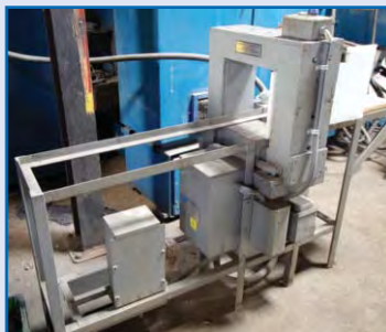
KODIAK METAL DETECTOR