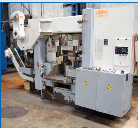
KASTO HBA-520U HORIZONTAL BANDSAW