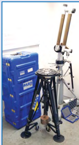
FARO PORTABLE CMM