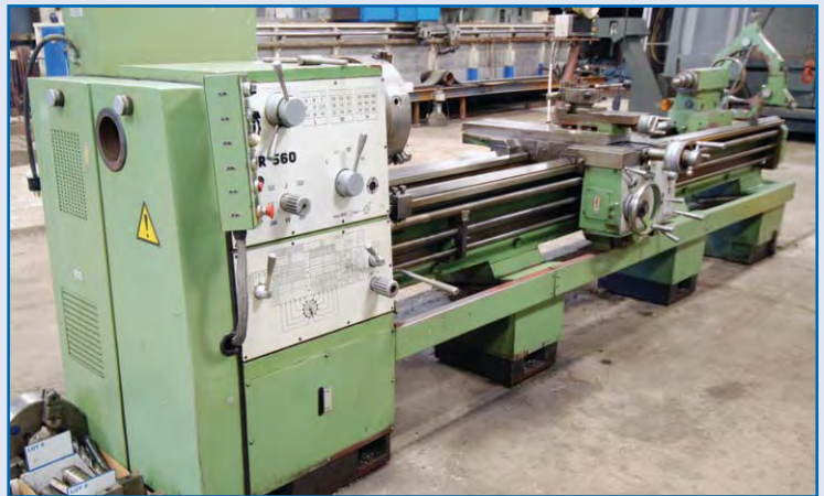
FAT TUR 560 ENGINE LATHE