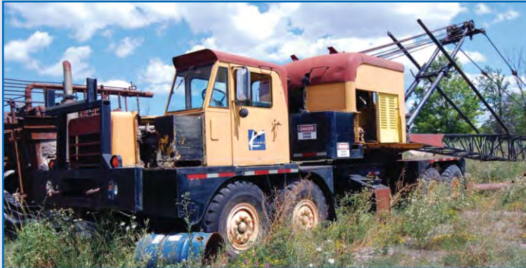
LORRAIN MOTO-CRANE PORTABLE TRUCK CRANE

Trinity Industries Air Compressor Holding Tank, 109" Dia x 65' L, 30,000gal, 250 PSI @ 125 Deg F, .6733ga Shell Thickness, .436ga Head Thickness, s/n 39317