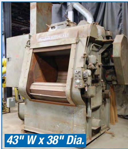
43" W x 38" Dia.