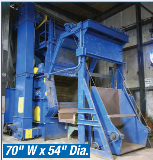
70" W x 54" Dia.