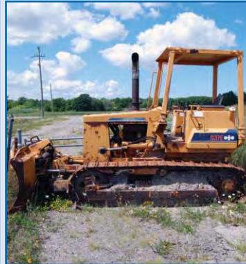
KOMATSU D375E-1 CRAWLER DOZER