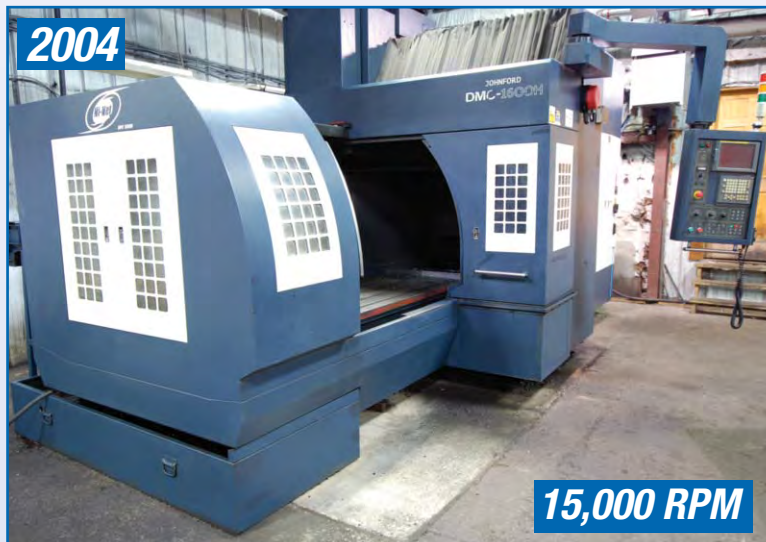
JOHNFORD DMC-1600H HI-NET MACHINING CENTER

1668 Allanport Road, Port Robinson, Ontario