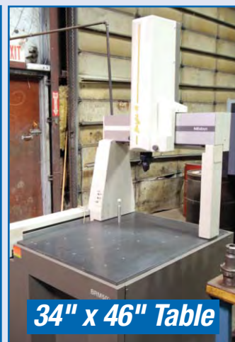
34" x 46" Table