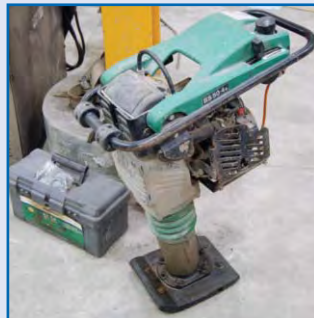
WACKER BS50-4S TAMPER