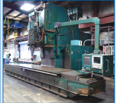
SETCO 53045 SPINDLE MILL