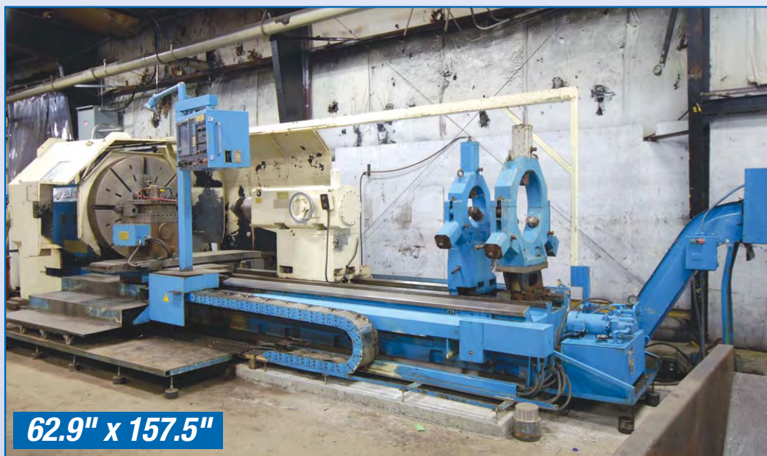
DAINICHI M152X400 CNC LATHE