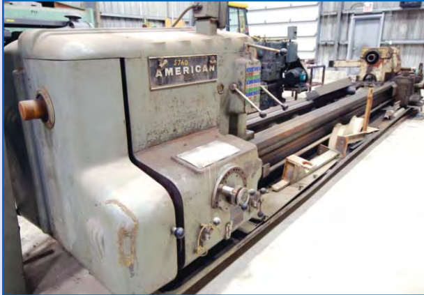
AMERICAN STYLE H ENGINE LATHE