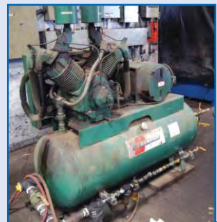
CHAMPION AIR COMPRESSOR