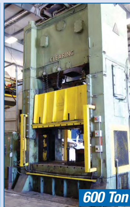
CLEARING F-2600-96 PRESS