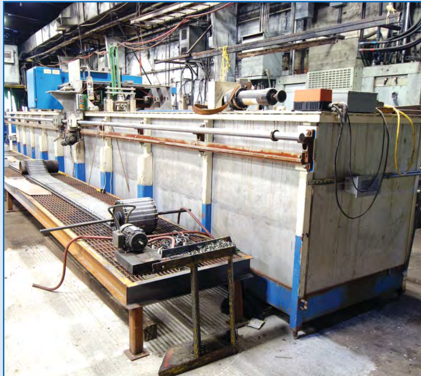
OVERHEAD SONIC WELDING SYSTEM

FERRANTI INTERNATIONAL METROLOGY SYSTEMS MERLINE XM CMM