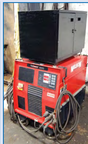
NELSON STUD WELDER