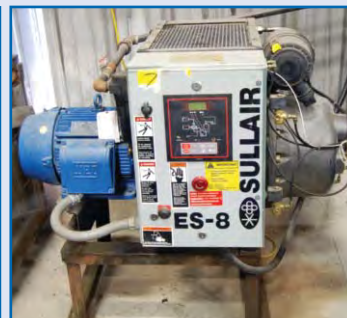
SULLAIR AIR COMPRESSOR