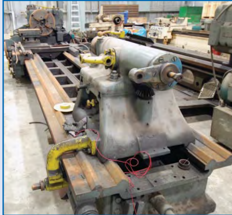
CRAVEN ENGINE LATHE