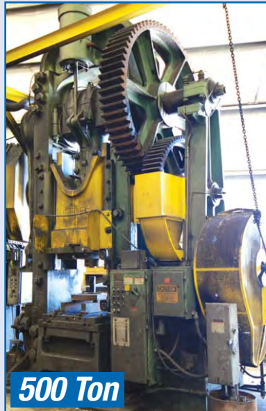
CHAMBERSBERG TRIM PRESS