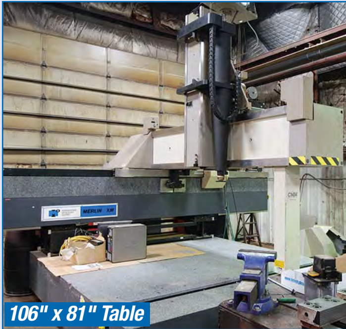
106" x 81" Table

HOIST FKE12.5 TYPE L ELECTRIC FORKLIFT, 25,000LB CAP., 2 STAGE, 95" MAX LIFT, FORK POSITIONERS, 65" FORKS, SIDE SHIFT, CUSHION TIRES, S/N 21463