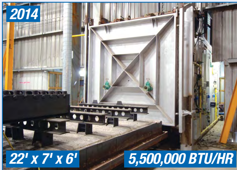
ECLIPSE COMBUSTION CAR BOTTOM FURNACE