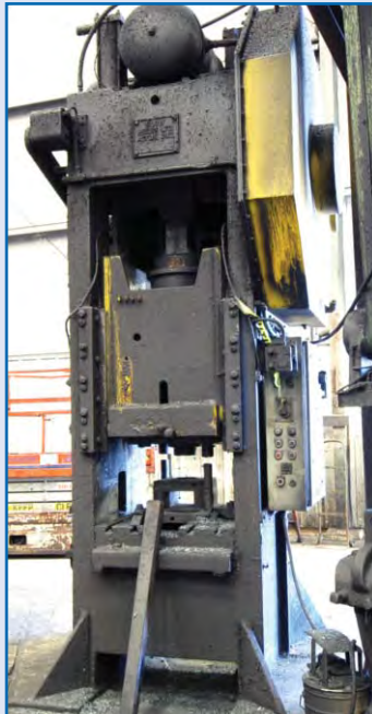
CHAMBERSBERG DOUBLE ACTION BLOW PRESS HAMMER PRESS