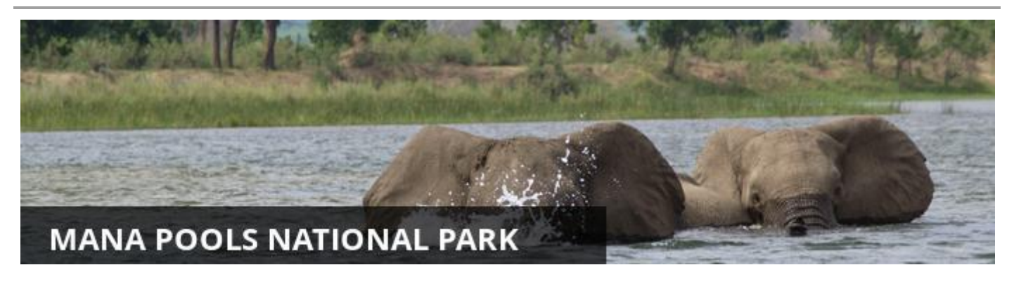
Day 9-11: Zambezi Expeditions, Mana Pools National Park

The life-giving power of the Zambezi River makes Mana Pools National Park one of Zimbabwe's most lush and flourishing regions, designated as the country's second World Heritage Site and known as one of the continent's premier game-viewing regions. Canoe trips are offered year round and provide a unique and memorable way for visitors to experience the area's striking scenic beauty and diverse fauna, while guided walks are a great way to take its pristine riverside forests.