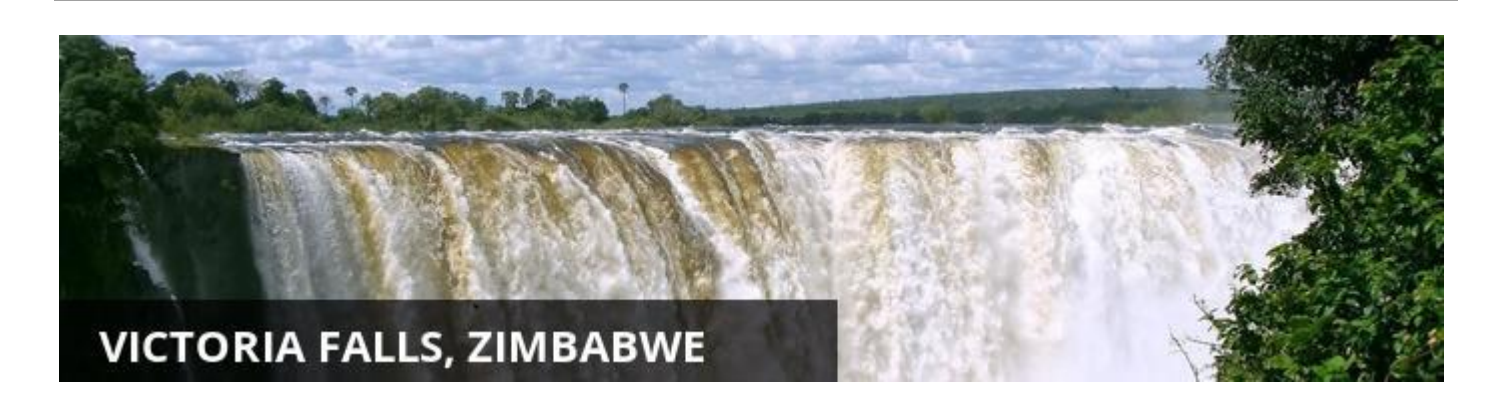
Day 5-7: Victoria Falls Hotel, Victoria Falls, Zimbabwe

One of the original natural wonders of the world, the Victoria Falls is a World Heritage Site and an extremely popular tourism attraction. Known locally as 'The Smoke that Thunders' this spectacle is accessible from both Zambia and Zimbabwe and it is an ideal place to combine a game viewing and water sports. There is excellent fishing, a terrifying bungee jump and arguably the best commercial white water rafting in the world.