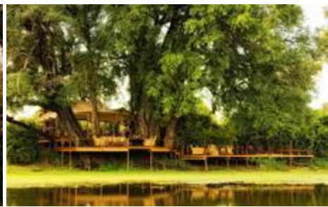
Included Fully Inclusive Drinks (Local Brands) Included