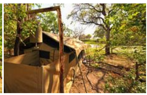
Included Fully Inclusive Drinks (Local Brands) Included