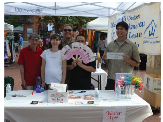
Some of the volunteers at the JACL booth for the 2012 Boulder Asian Aloha Festival

On the weekend of August 11 and 12, 2012, representatives from the Mile High (formerly Mile Hi) JACL stood in the shade of a tent on Pearl Street selling goods at the annual Boulder Asian Aloha Festival. Although we thought this would be a good fundraising activity, we decided to offer great deals and not make as much money. However we were able to accomplish our main goal, which was promoting JACL. Two hundred and fifty fans were created with the new Mile High JACL website ( www.MileHighJACL.org ) and labels with the new web link were put on senbei (rice cracker) bags for sale. Although the Mile High JACL site is still under construction, board members thought the Boulder Asian Aloha Festival would be a good way to introduce our new address. We handed out the JACL fans free with any purchase of water, senbei bag, generously donated hand-made greeting cards, or crane decoration. Water was by far the best selling item. Without the shade of the tent, it was like any other weekend in Colorado this summer: HOT. However, the energy was great, and we were positioned right in front of the stage, so during the times people weren't crowding around the JACL booth, we had a chance to watch some of the performances. If you had the chance to stop by, thank you. Otherwise, you can probably find us around with extra fans to get you through the rest of the summer (and to remember our new email address).