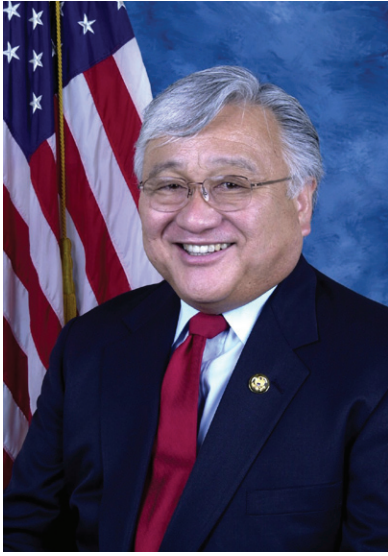
Congressman Mike Honda (CA)

The Millennium Club welcomes eight new members who joined the club last month at the National Convention in Bellevue, Washington. Congressman Mike Honda led the way by becoming a Millennium Club Member at the start of the convention. Congressman Honda is a longtime JACL member and the only Congressional member to belong to the Millennium Club, and has been a tireless advocate for the AAPI community.