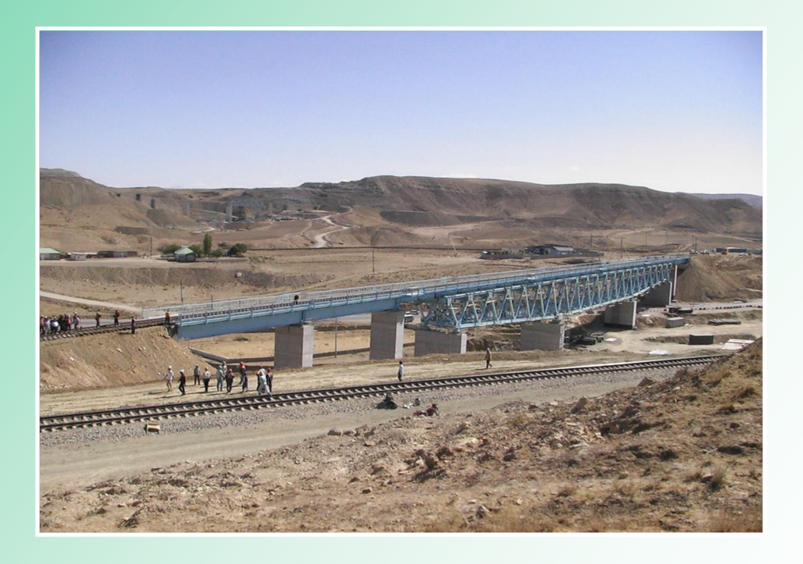
Tashguzar-Kumkurgan New Railway Construction Project