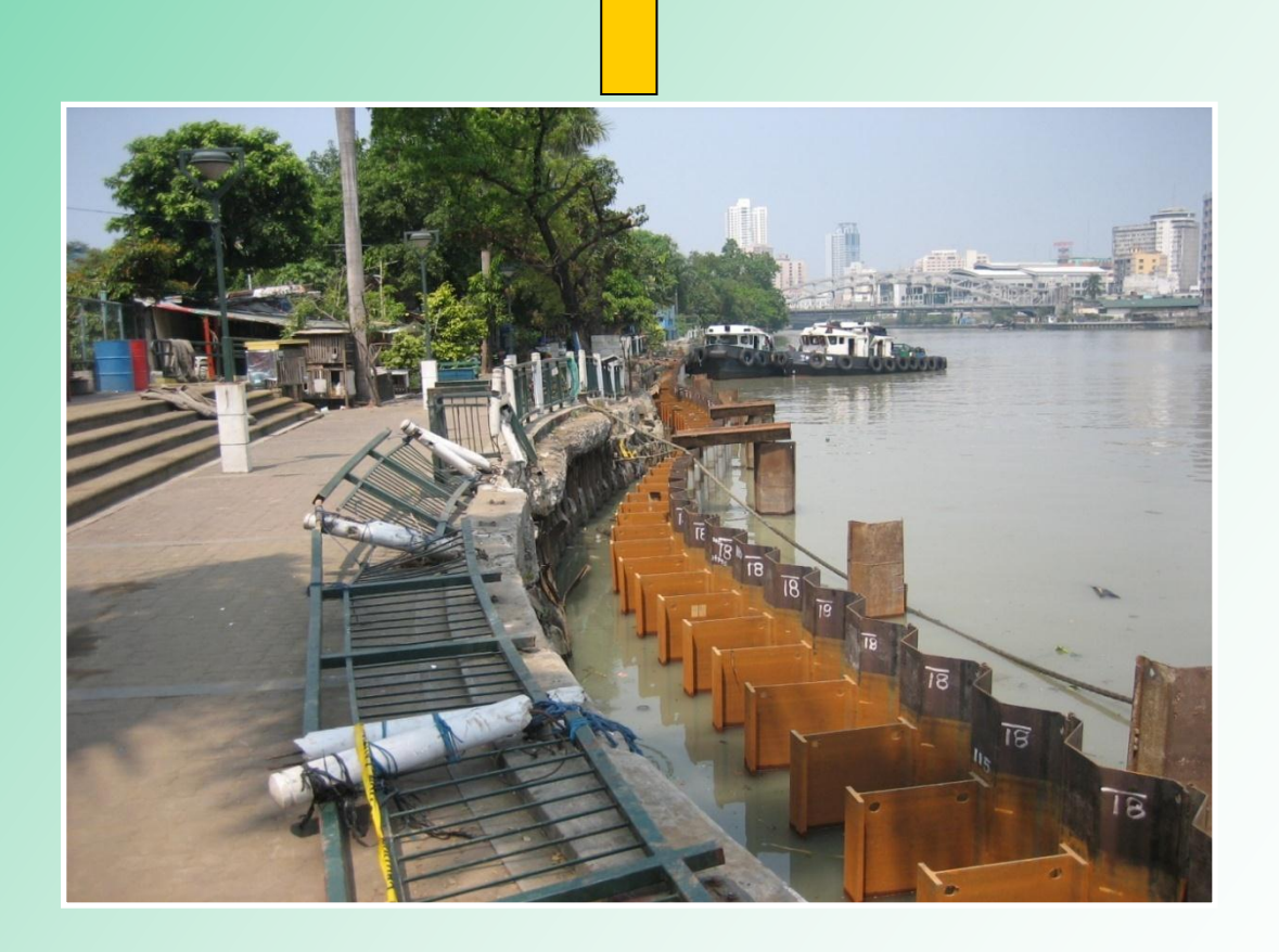
Steel Sheet Pile