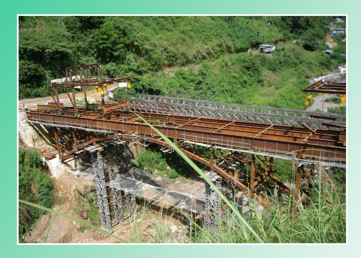
Urgent Bridges Construction Project for Rural Development