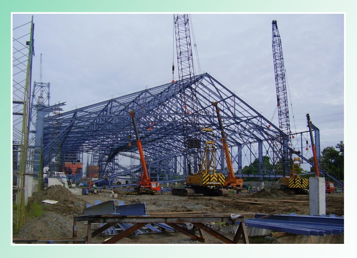
Cagayan de Oro Power Plant Project