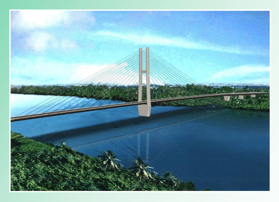
2<sup>nd</sup> Magsaysay Bridge and City Bypass Road Project