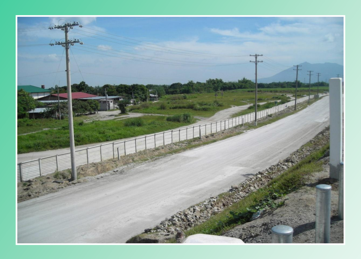
Subic-Clark-Tarlac Expressway-Fencing Project Package 2