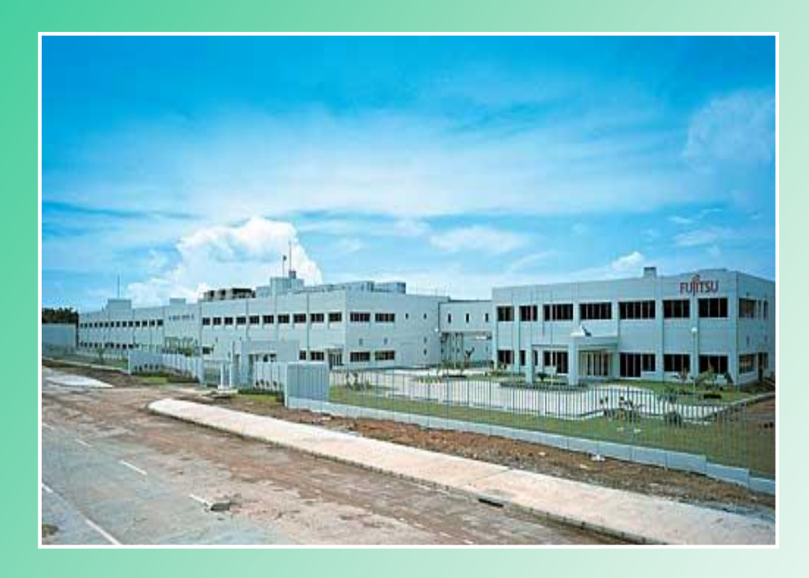
Fujitsu Factory Building II Project