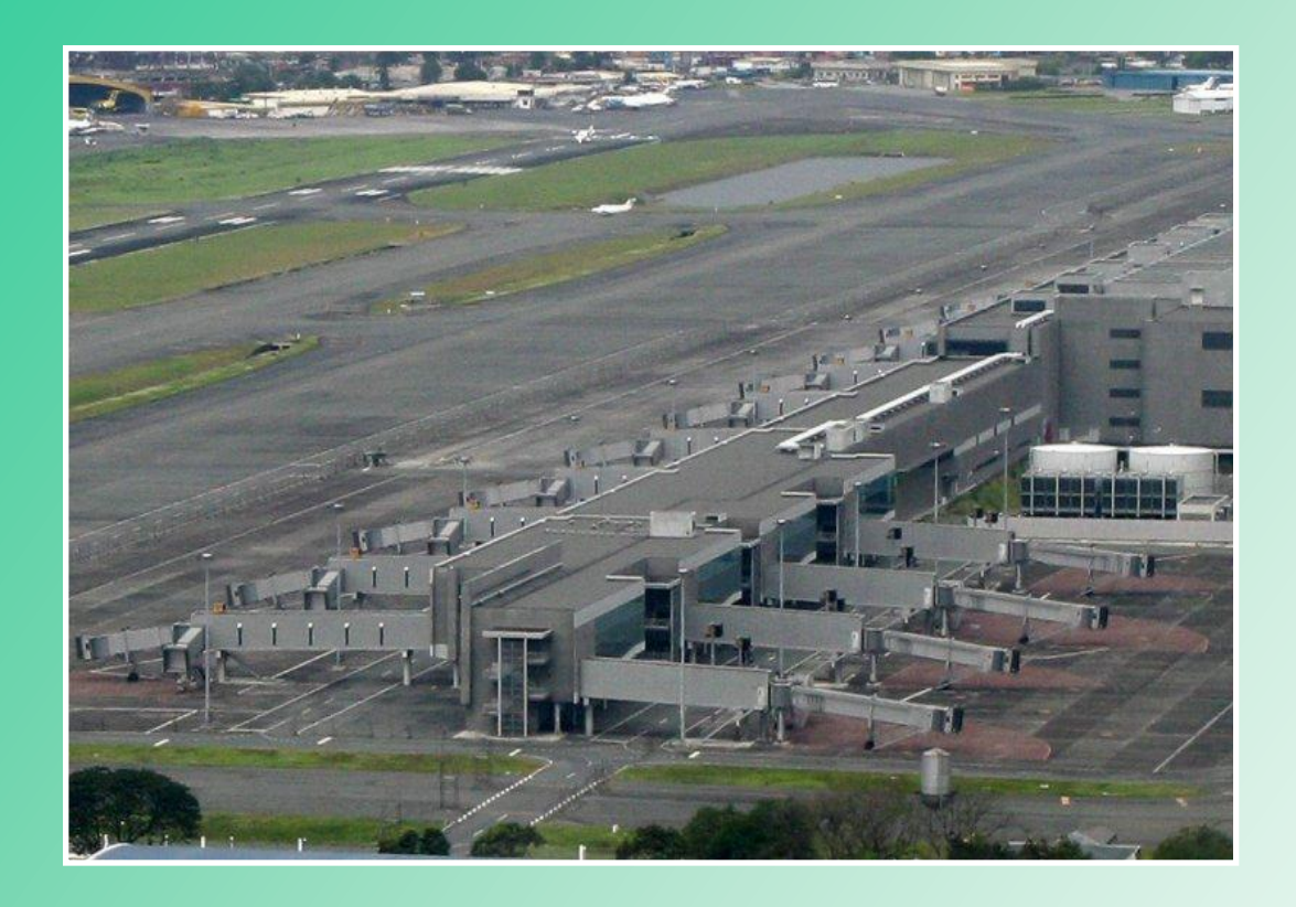
NAIA IPT3 Airport Project