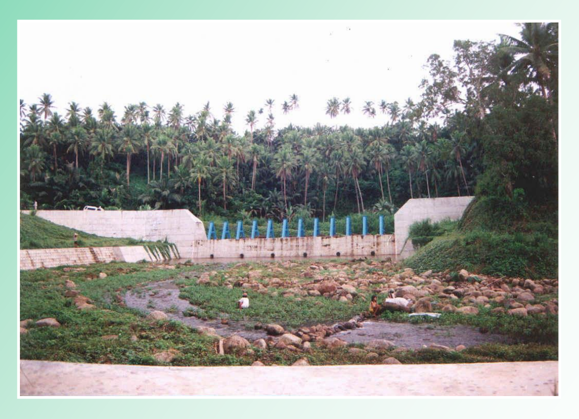
Slit Dam Project