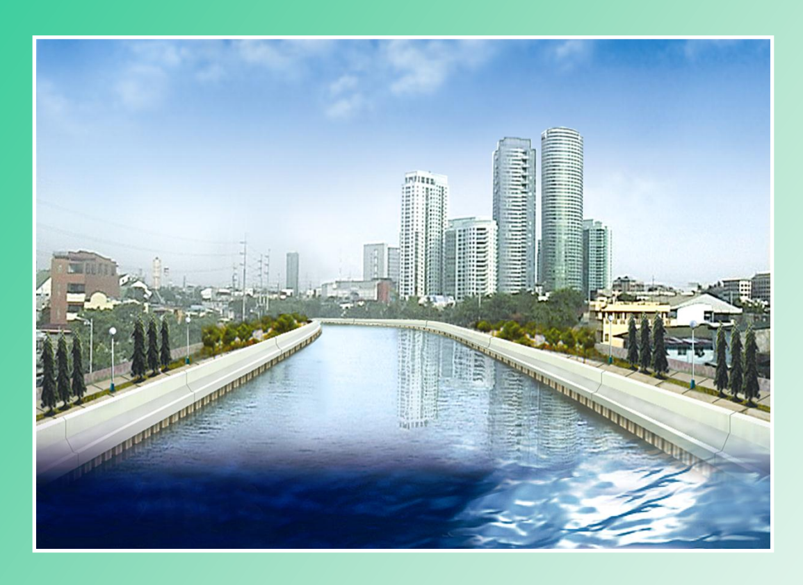
Pasig-Marikina River Channel Improvement Project