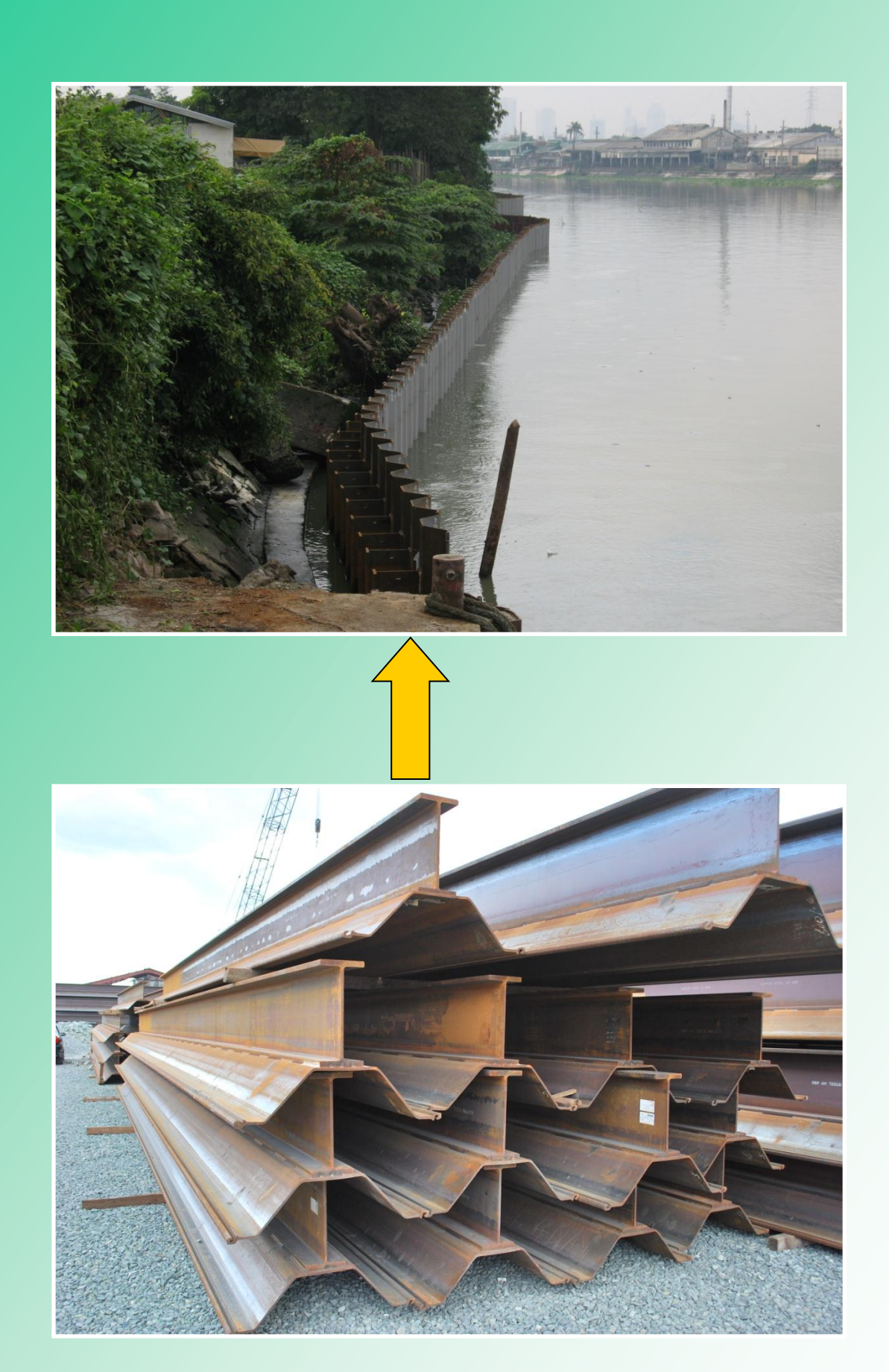
Steel Sheet Pile