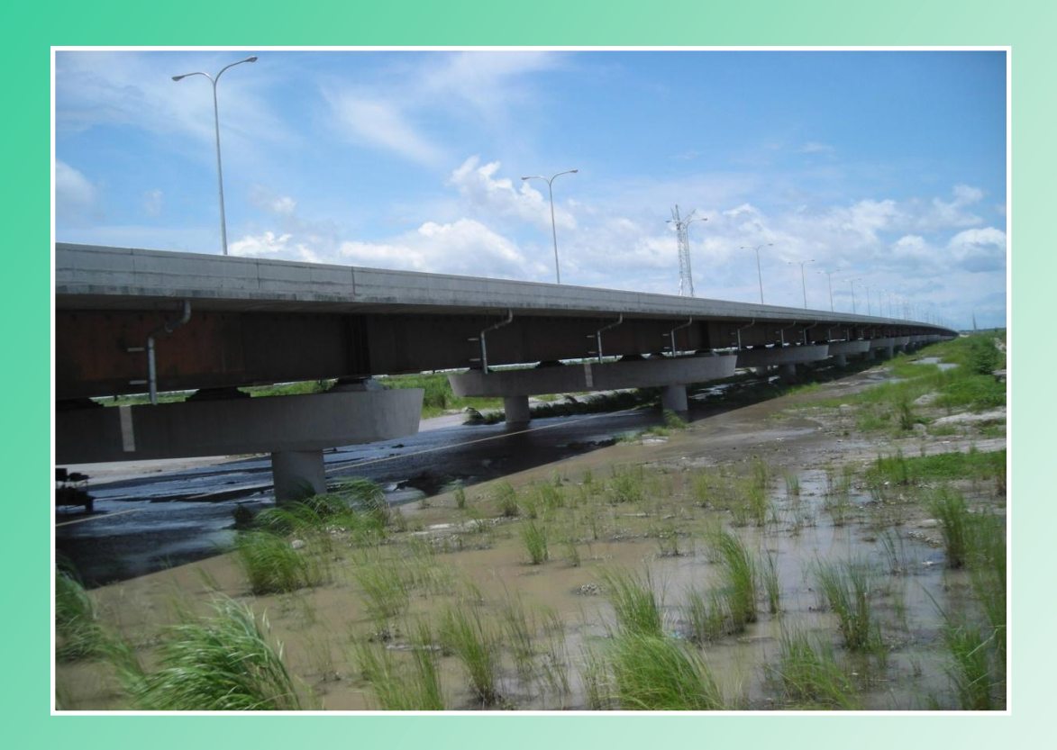
Subic-Clark-Tarlac Expressway Project Package 2