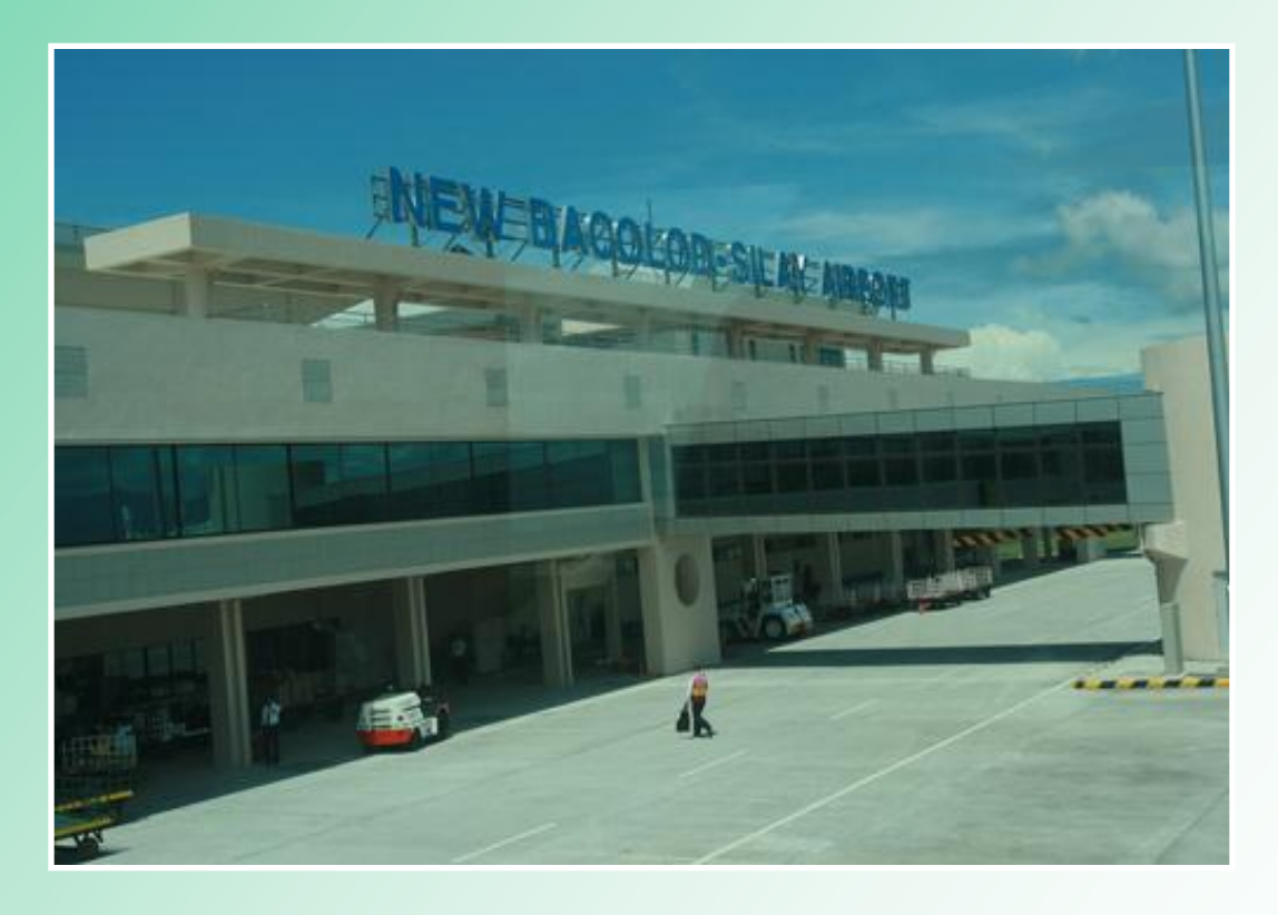
New Bacolod-Silay Airport Development Project