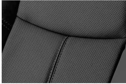
Black leather accented* seat trim. Available on ST-L and TI only.