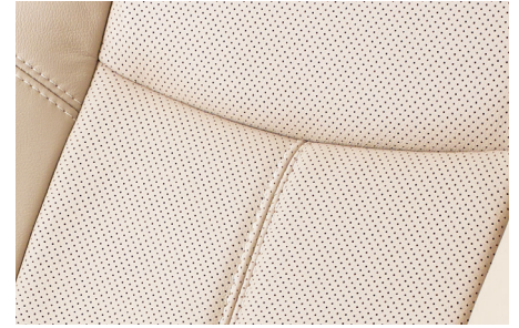
Ivory leather accented* seat trim. Available on ST-L and TI.

Minor trim variations may occur from time to time. *Leather accented features and upholstery may contain synthetic material.