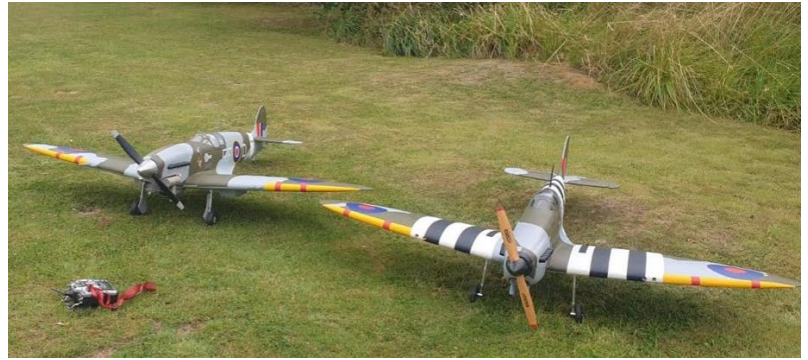
There were 3 Spitfires in action over Xmas from Pete, Mat, and Wayne.