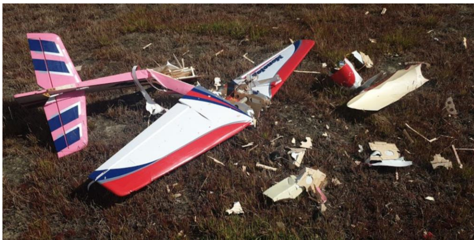
Proof that the ground still sucks – the remains of Murray's Monolog 😞