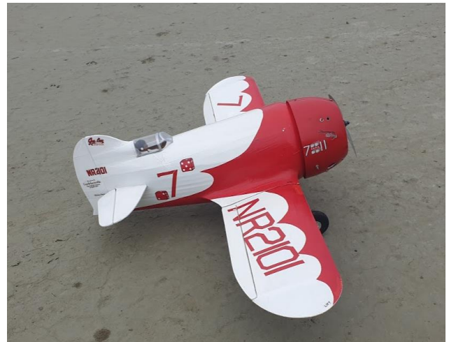
Denis' gift for Mat (and yes it flew...)