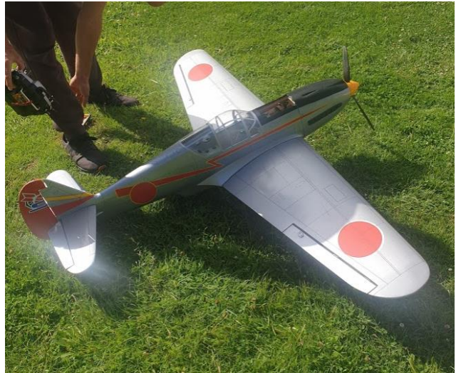
Pete's Pilatus and Japanese fighter.