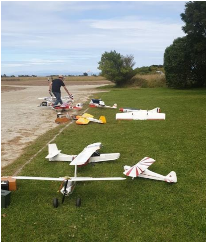
The start of a Sunday morning collection ...