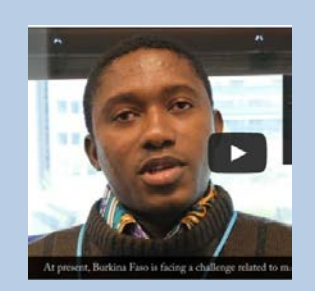
Click on the image!

Two member states delineate the size and dimensions of the hunger challenge in their respective