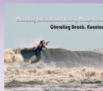
Cherating International Surfing Competition Cherating Beach, Kuantan

Date : 11 to 13 December 2015 Venue : Cherating Beach, Kuantan, Pahang Organiser : Ministry of Tourism and Culture Pahang Contact : 09-5171111 Email : pahang@motac.gov.my