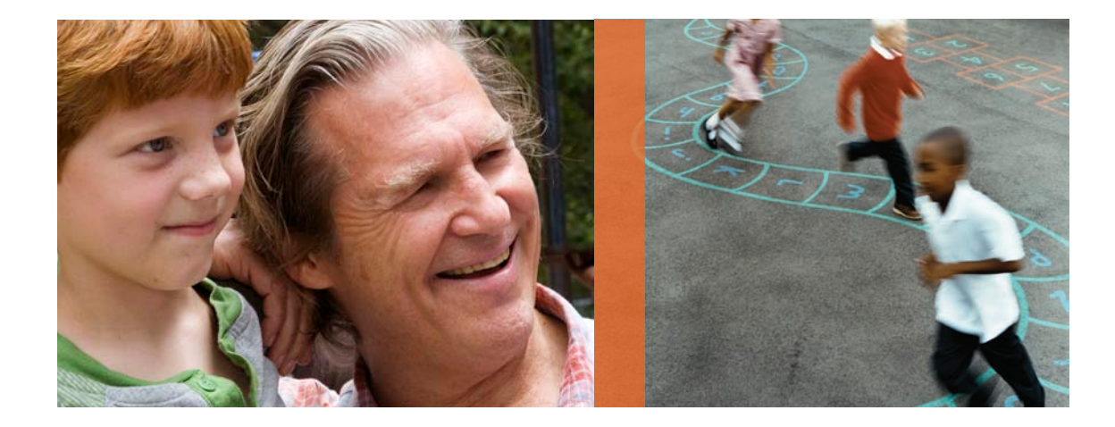
Part 2 | Guidelines Logo Logo Usage Recommended Language

Receipt information is also required on all point-of-purchase customer donation tactics.