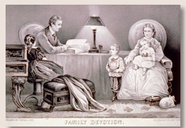
An 1871 illustration, "Family Devotion," shows a husband at his studies and his wife caring for the children.

were routinely disparaged as "unnatural" and "unfeminine." When women finally won the right to vote in 1920, the Cult of Domesticity was in decline, but it rose again in the 1950's as television resurrected its values by portraying the "ideal" family as a working father, stay-at-home mother, and several kids. Nowadays we celebrate many different kinds of families, though certain conservative ideas about the place and role of women persist.