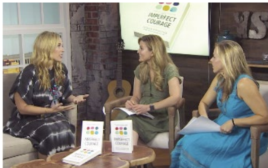
NASHVILLE NEWS 4