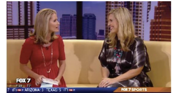
FOX 7 AUSTIN