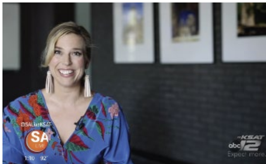
KSAT SAN ANTONIO