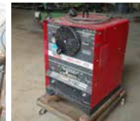
Lincoln Idealarc 250