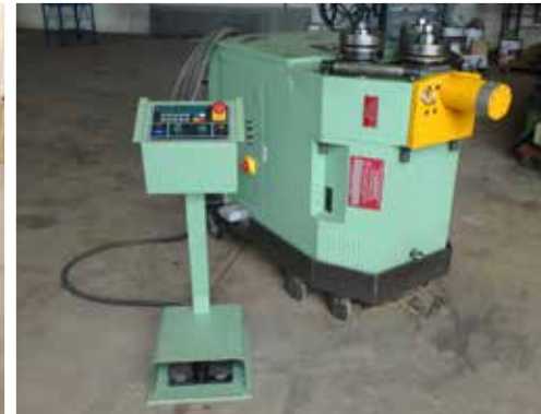
2006 Eagle CPH40 Bending Roll