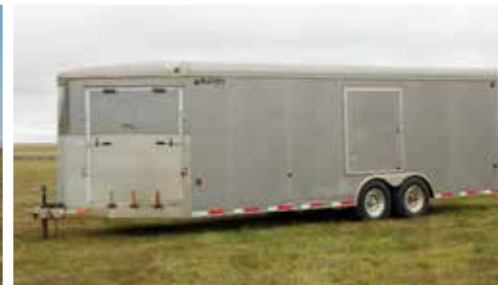
2005 Royal Cargo 28 Ft