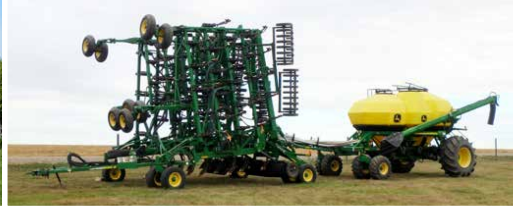
2010 John Deere 1830 60 Ft w/1910