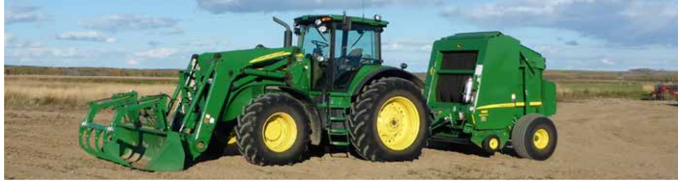
2010 John Deere 7830 & 2016 John Deere 569