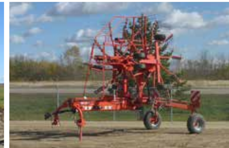
2013 Kuhn GA7501 23 Ft