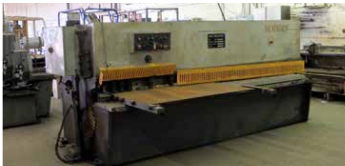
Modern QC12Y-8X3200 Hyd. Swing Beam Shear