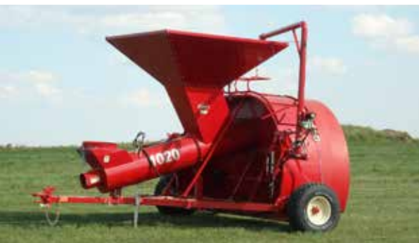
2014 Renn RGB1020