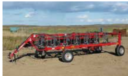
2012 Massey Ferguson MF3986 28 Ft