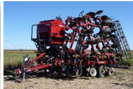
2015 Salford I-4141 41 Ft w/Valmar 3255