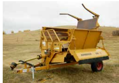
Haybuster 256 Plus II