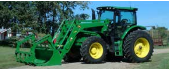
2014 John Deere 6150R w/H360 – Low Hours