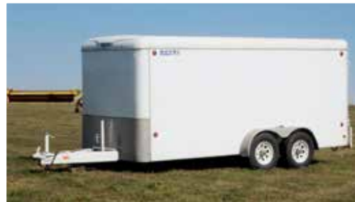
2005 Royal Cargo 17 Ft