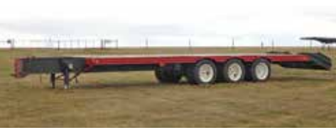
2003 Custombuilt 30 Ft x 8 Ft 6 In