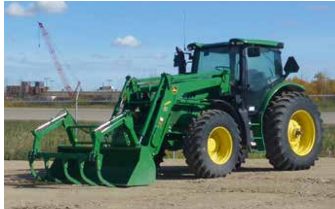
2013 John Deere 6150R – Low Hours