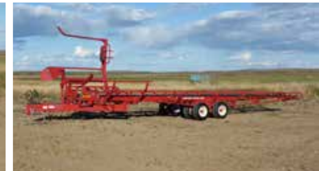
2015 Morris 1400 Hay Hiker