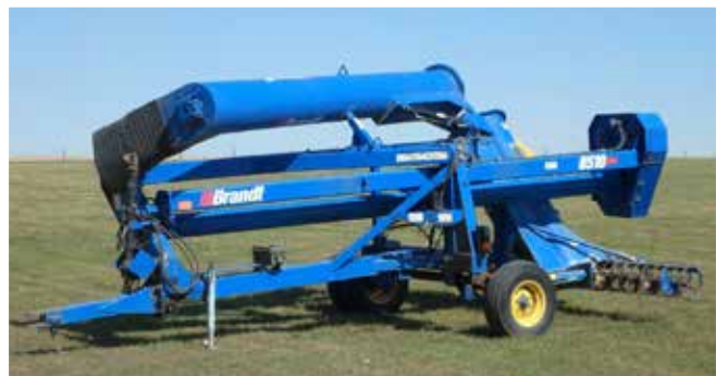
2010 Brandt 8510

» See complete and up-to-date listings for this auction at