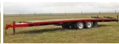
1991 Custombuilt 28 Ft x 8 Ft