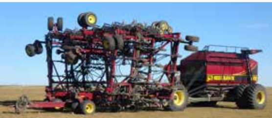
2013 Seed Hawk XL Series 72 Ft w/800