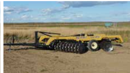
2013 Kello-Bilt 275-3726BWF 16 Ft