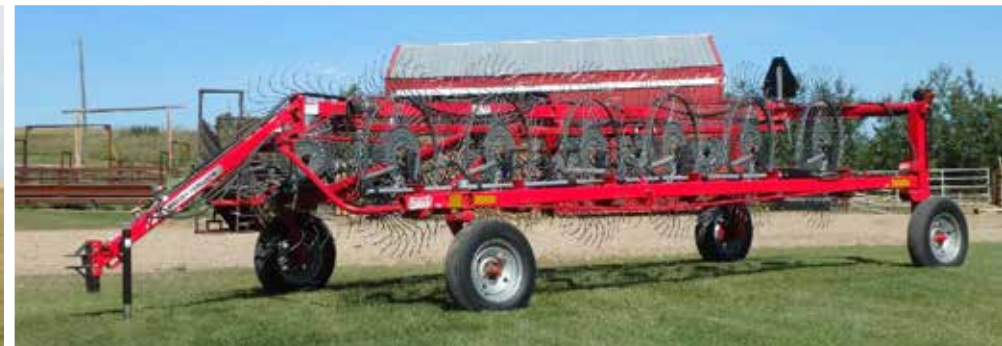
2012 Massey Ferguson 3983 24 Ft