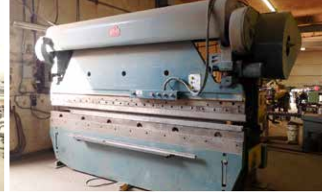
Mercury 90 Ton Brake