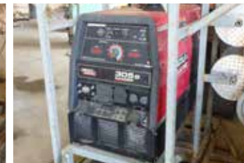
Lincoln 305 G