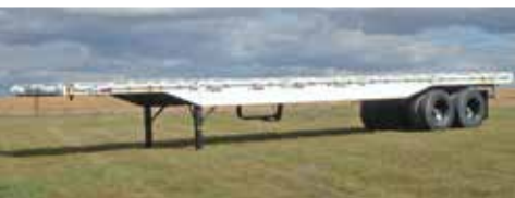
1981 Lode King 44 Ft x 92 In