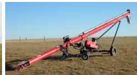
Wheatheart BH1041 Auger