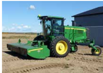
2012 John Deere R450 16 Ft – Low Hours