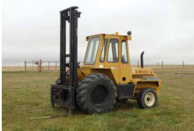
1989 LiftKing LM 8M42 8000 Lb