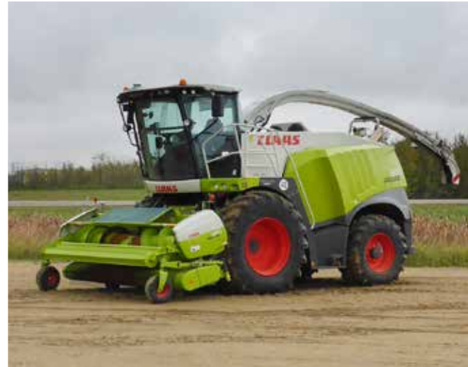
2016 Claas Jaguar 970 RWA