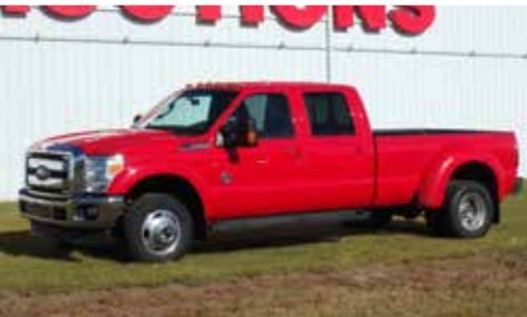
2011 Ford F-350