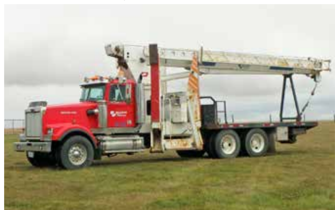
1995 Western Star 4964F