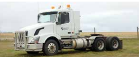
2006 Volvo VNL