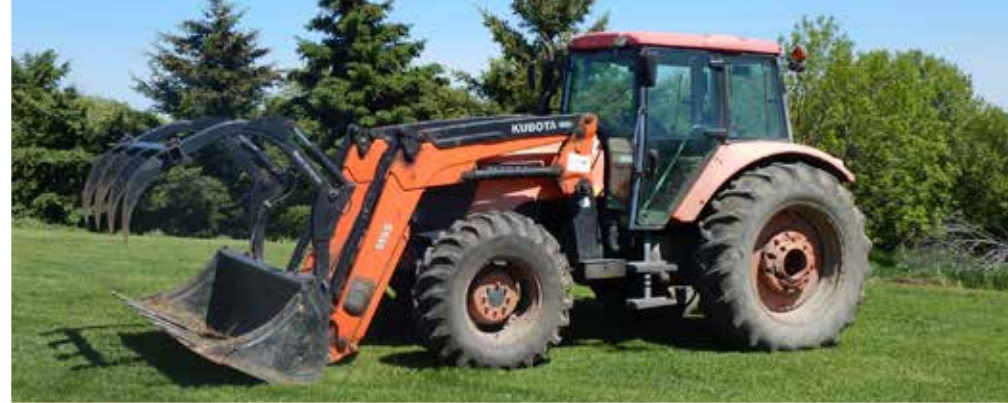
2008 Kubota M125X w/M55