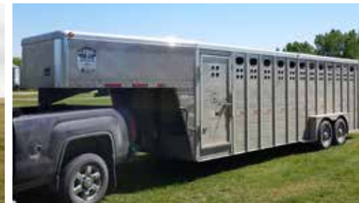
2011 Merritt 24 Ft