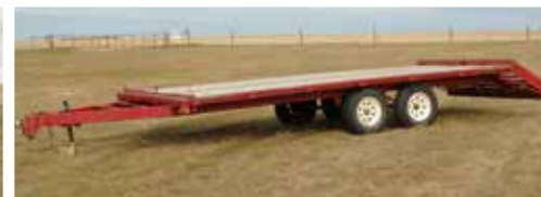
2014 Custombuilt 18 Ft x 8 Ft