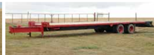
2007 Custombuilt 30 Ft 8 In x 8 Ft