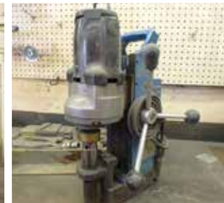
Haugen 1091 Magnetic Drill