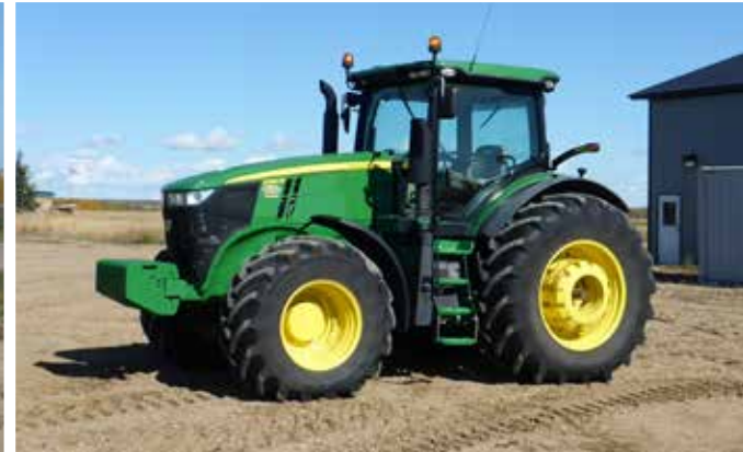
2015 John Deere 7290R – Low Hours