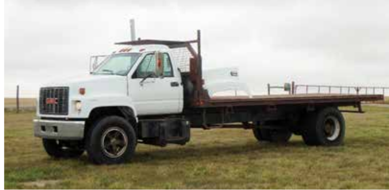
1998 GMC C7500