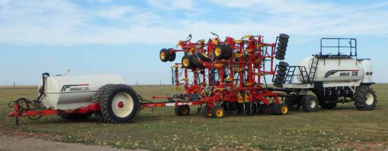
2007 Bourgault 5710 47 Ft w/6350 & 2400 Gallon Liquid Cart