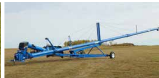
2011 Brandt 1390HP