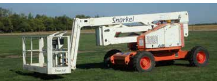
2006 Snorkel AB50J 50 Ft 4x4