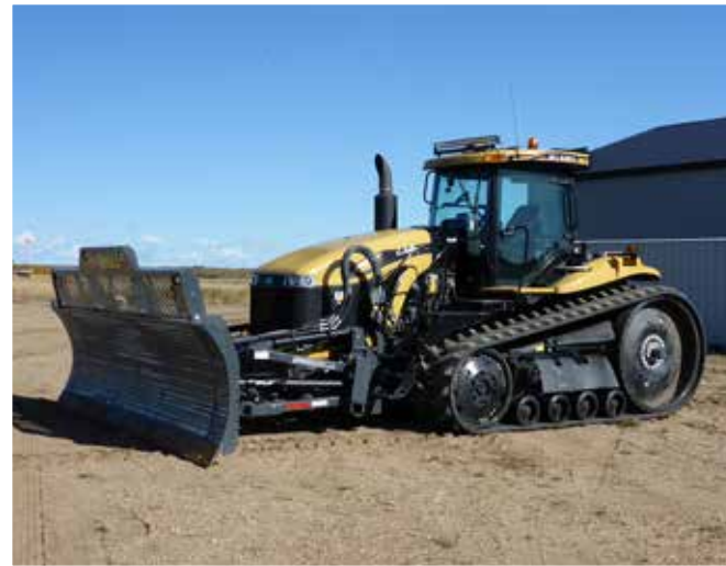
2013 Challenger MT835C w/ AMI Pitbull 16 Ft – Low Hours