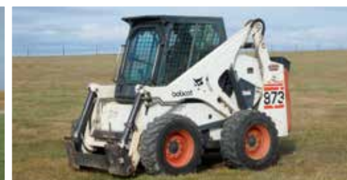
1998 Bobcat 873