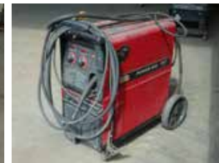
Lincoln Power Mig 255C