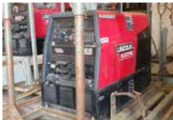
Lincoln 225 Ranger