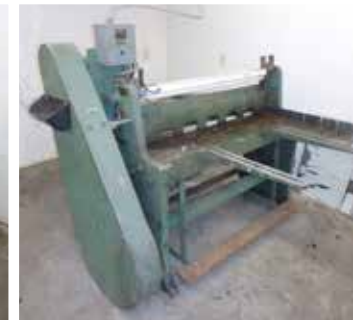
Brown Boggs 349C Mechanical Shears