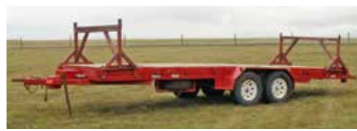
1998 Custombuilt 22 Ft x 6 Ft 6 In