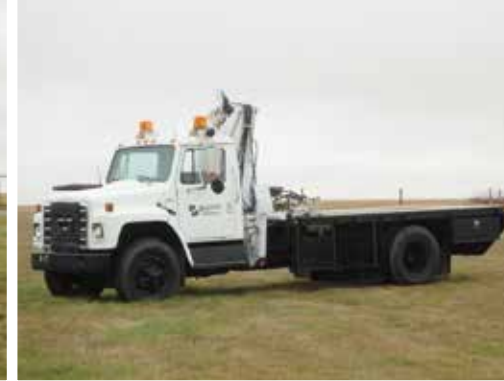
1983 International 1724 w/Viva 13000 Lb