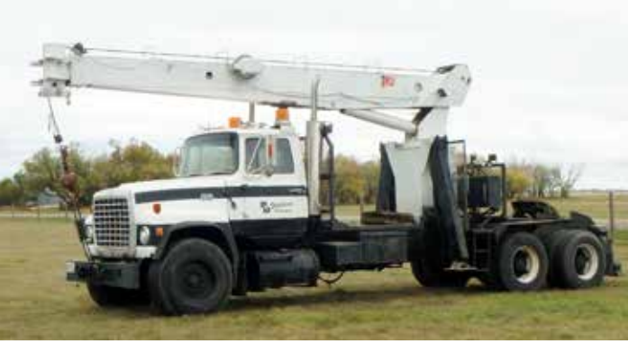
1979 Ford L9000