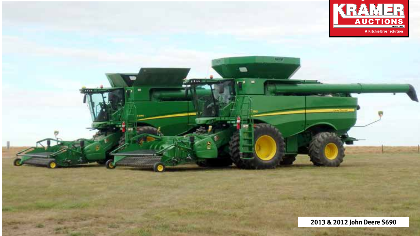
2013 & 2012 John Deere S690