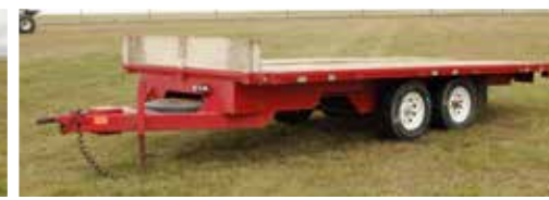
1990 Custombuilt 16 Ft x 8 Ft