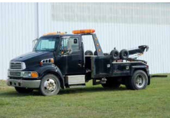
2003 Sterling M6500 Actera