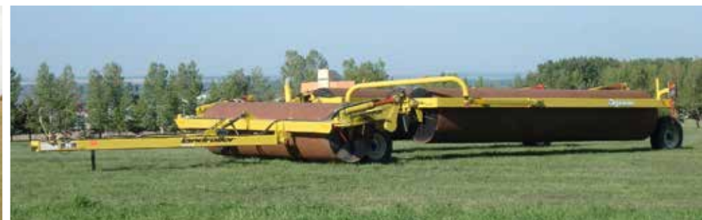
2008 Degelman LR7645 45 Ft