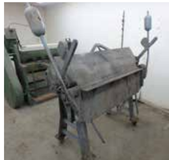
Chicago Hand Brake