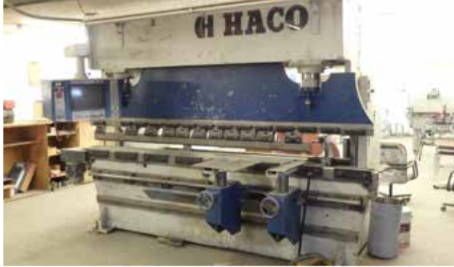
Haco PPES 30135 135 Ton Brake

Over 100+ Welding Items! Please see equipment listings on page 6.