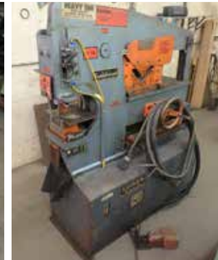
Scotchman 6509 65 Ton