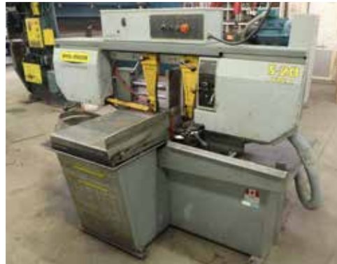
Hyd-Mech S-20 Hyd-Mech Saw