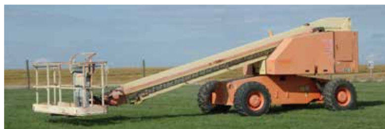
2000 JLG 601S 60 Ft 4x4