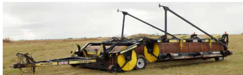
2013 Ag Shield 12-46-3 46 Ft