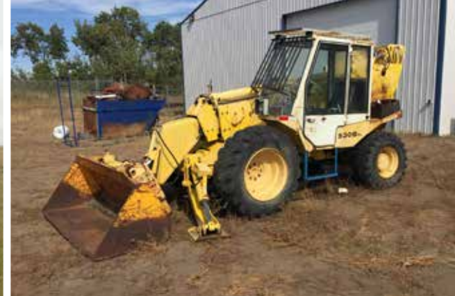
1986 JCB 530B HL