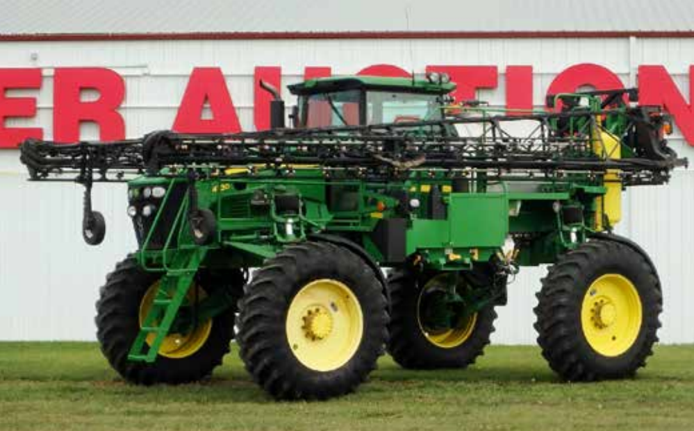
2008 John Deere 4730 100 Ft