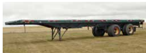
1975 Trailmobile 42 Ft x 90 In