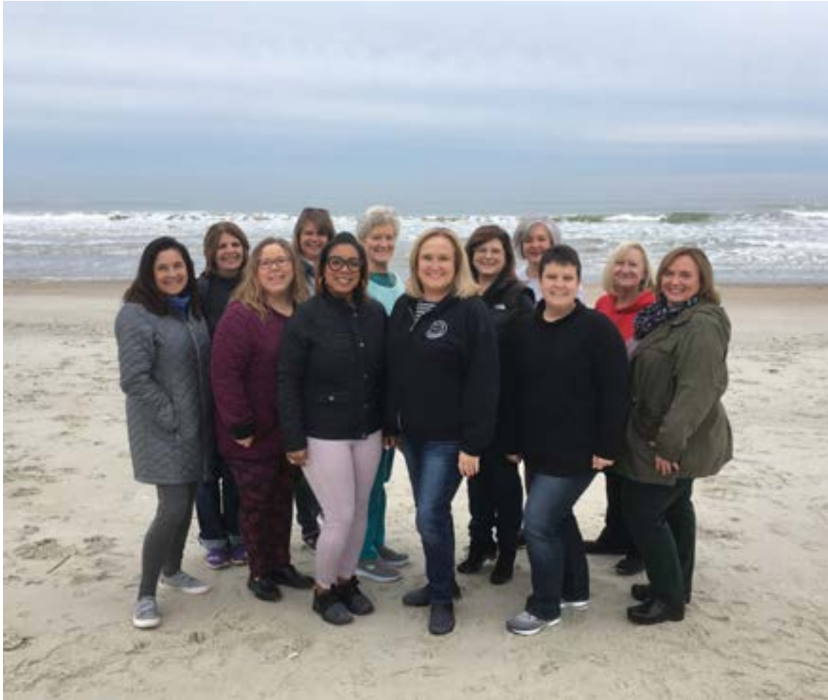
2018- 2020 GFWC-NC Executive Committee and Junior Officers in Holden Beach during their latest Retreat.