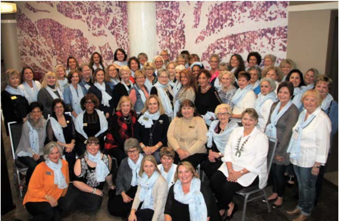
GFWC-NC Clubwomen attending the SER Conference in Winston-Salem, NC

Dedicated to Community Service Since 1902