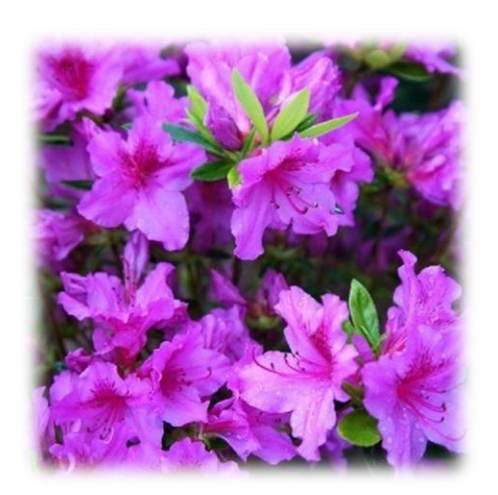
Azalea 'Blue Danube'