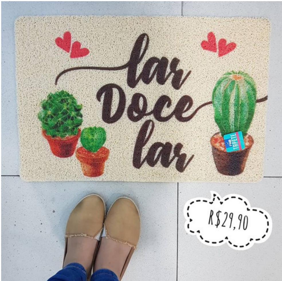
Figure 4 < https://www.instagram.com/p/BmbxvzhNW1/?utm_source=ig_web_copy_link >

When items from her home are shown in the posts, whether public or not, they are accompanied by information on the retailer and price, indicating a good buy: