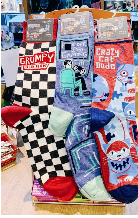
Socks should never be boring! Make a statement with these clever, creative designs, sure to spark joy for yourself or for a friend.