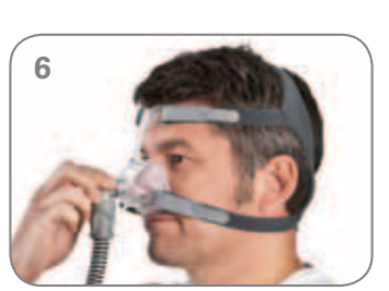
Attach the combined elbow assembly and air tubing to the mask by pressing the squeeze-tabs and pushing into