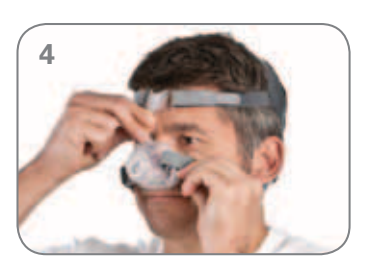
Bringing the lower straps below the ears, loop the headgear into the lower hooks on the mask