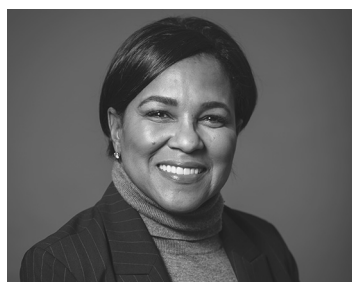
Rosalind G. Brewer Group President, Americas and COO of Starbucks Corporation