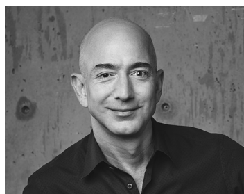
Jeffrey P. Bezos Founder, Chairman, and CEO of Amazon