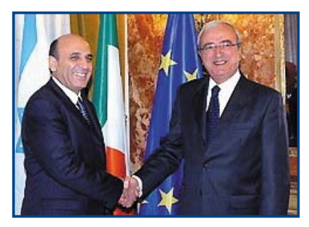
Italy is a major contributor to many international missions, i.e. UNTSO, MFO and TIPH. <>

he first official mission of an Italian Minister of Defense to Israel after the signing in June 2003 of the Memorandum of Understanding for Cooperation in the military and defense sectors, will take place on 27-28 June, confirming an increasingly solid relationship between the two countries on security issues. Minister Antonio Martino (photo) will be received by P.M. Ariel Sharon and his Israeli colleague Min. Shaul Mofaz and by Foreign Minister Silvan Shalom. Intense bilateral cooperation is being implemented in multilateral frameworks such as the EU European Neighborhood Policy and NATO's Mediterranean Dialogue.