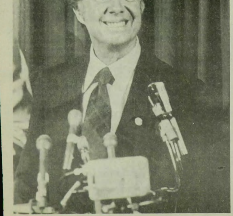
Carter fielded questions from local and national reporters in a press conference at the South Bend Airport.

A strong intelligence agency is needed for foreign On the busing issue, Carter declared that policy and defense, Carter said. Intelligence "integration suits me fine" but that he opposes agencies, however must obey the law, Carter said, agencies, however must obey the law, Carter said, in Atlanta, Carter said, because only poor children attempts to overthrow foreign governments and (continued on page 6) domestic spying.