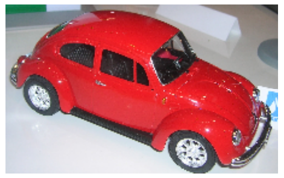
The built up kit on display at the iHobby Expo.