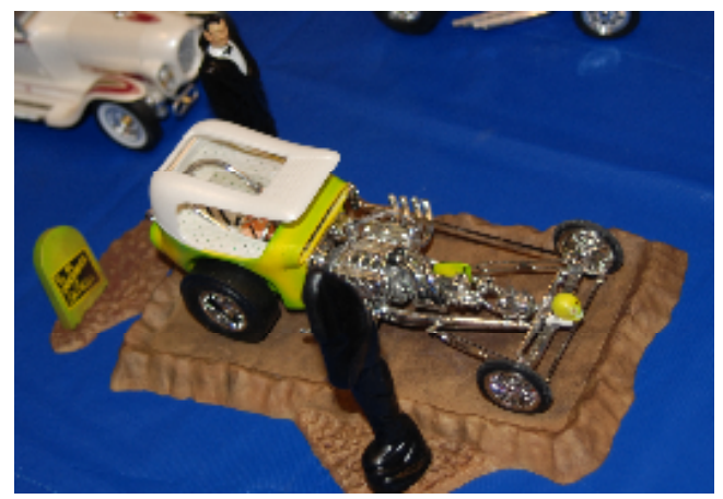
Just in time for Halloween, Dragula.