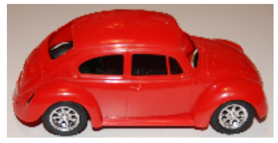
The new Aoshima kit.

The simplified kit features a one piece body, plated wheels and wide treaded vinyl tires. While the interior is somewhat shallow it has more depth than similar types of kit, so it looks like painting it all flat black would minimize the effect. This newest release has a body molded in red. the other parts are black along with chrome and clear pieces. On the body there were very noticeable mold lines at the top of both front and rear fenders that were hard to clean up. The chassis has a detachable lid for the battery compartment as well as several holes for wires and switches for the intended electric motor. One distinct feature of this kit is that there is an option of either left or right hand drive, with specific dashboards. The decal sheet contains markings to do the version seen on the earlier box art. The glass is one piece of clear plastic that snaps in The headlights and taillights from the bottom. feature clear lenses along with chromed buckets.