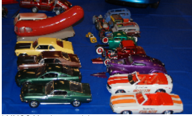
LMMCC Members models.