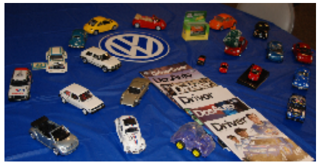
A display of VW models.