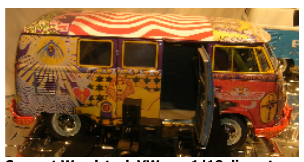
Suncast Woodstock VW van 1/18 diecast

figures from Motor Head Miniatures, including 1/24 scale. Alpha Precision Abrasives is a new to me tool company, with several interesting sanding tools. I spoke to Accurate Miniatures who confirmed that due to low sales of the Corvette Grand Sport kits they have no current plans for any more auto kits at this time.