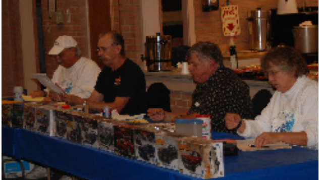
The head table.