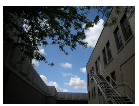
Youth Voices for Change

The testimonio interviews were conducted in three phases across three meetings. The first phase began with a testimonio interview and mapping or drawing exercise (Lynch, 1960) on youth perceptions of their environment and ended with a demographic interview questionnaire. Each participant was given a disposable camera to take photographs of places or things in the area that were important to their life-stories. The second phase, a testimonio interview and mapping exercise, focused on their school experiences from pre-school to the present. The final, third phase, a