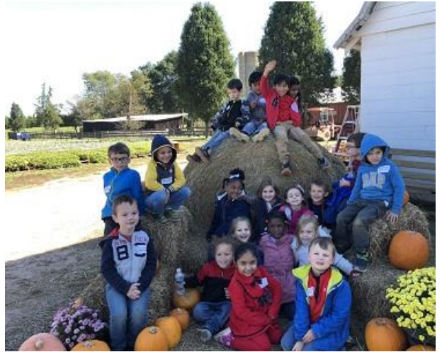
Kindergarten visited Braehead Farms in October.