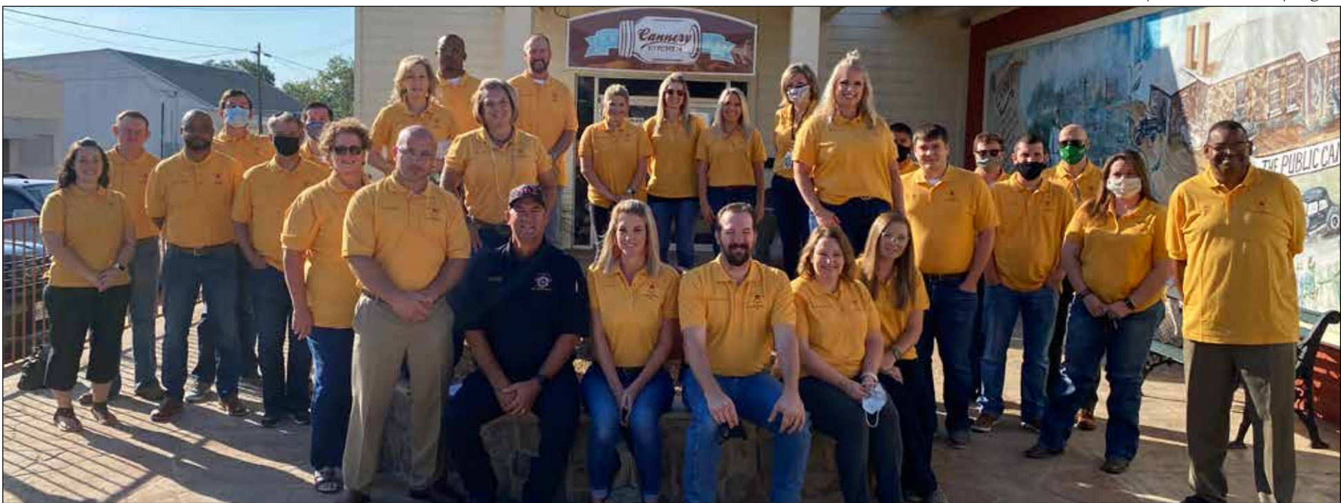
LWC Class of 2021 at the Cannery Kitchen in October.