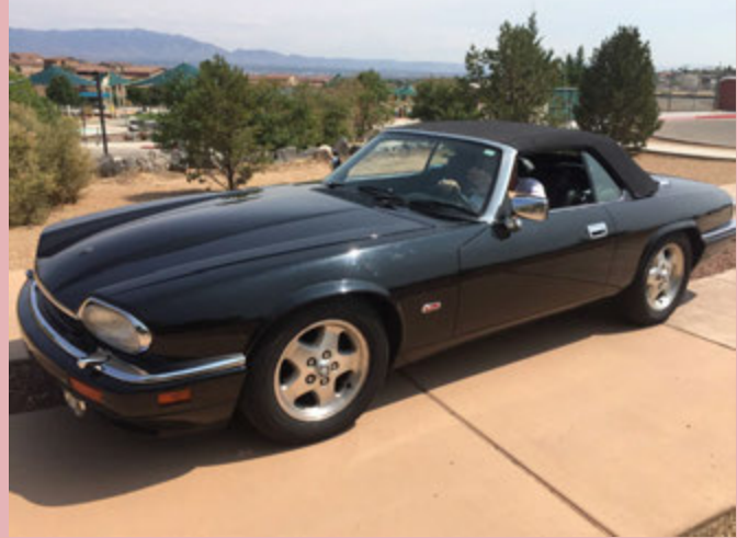
This was one of favorites of the crowd – nice ride.