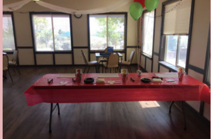
Salsa tasting stations, ready to go