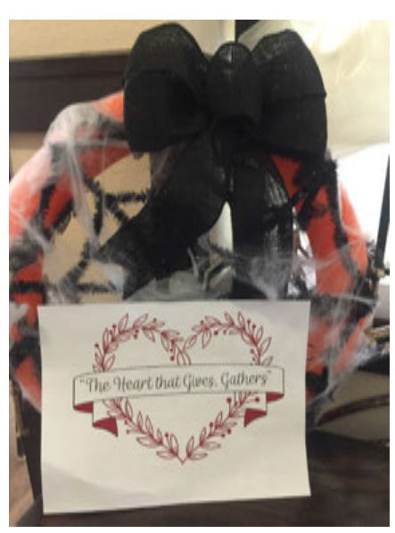
Finished product turned out very nice. Not too scary.